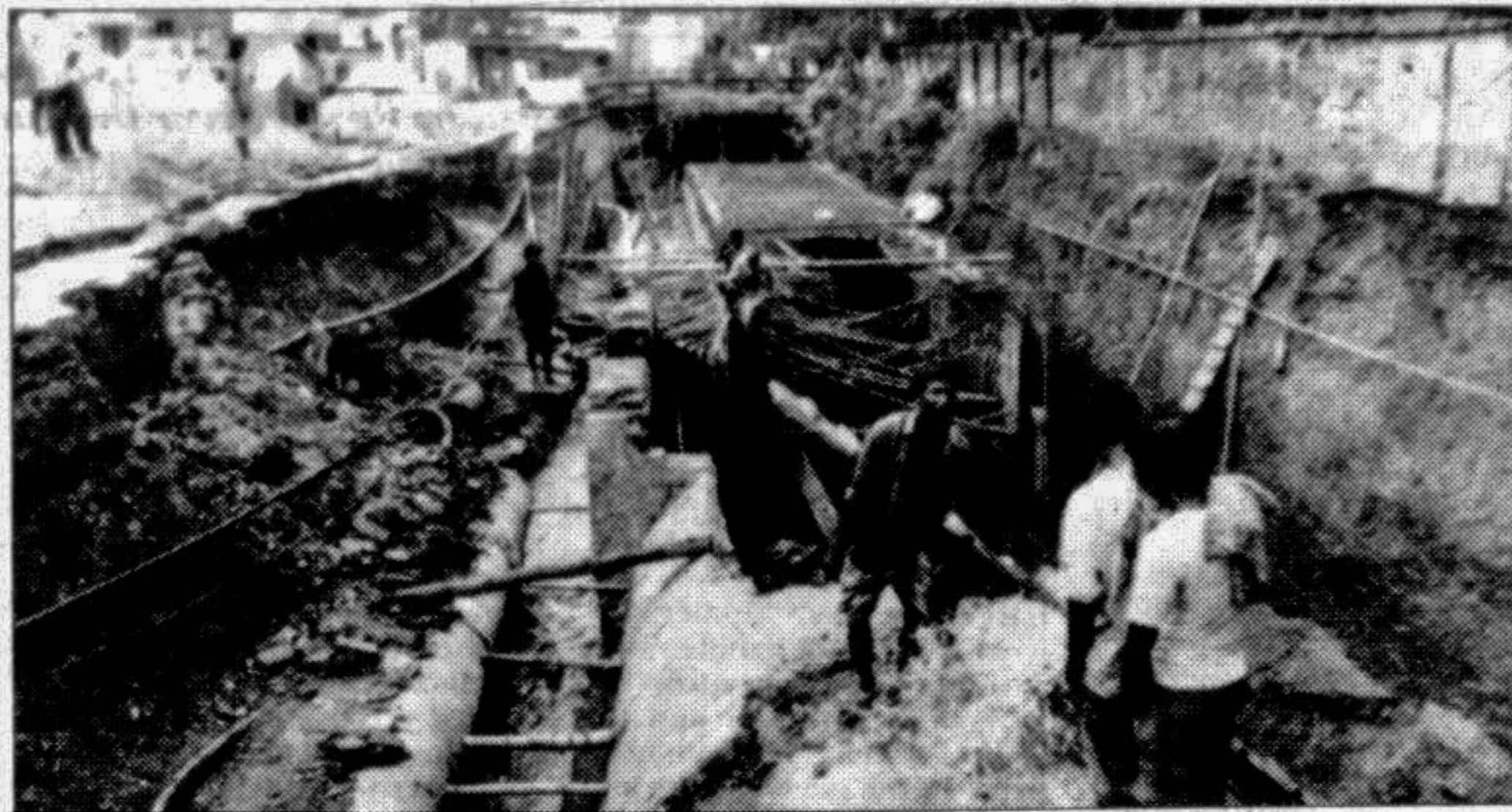
Reconstruction of sewerage line in city's Hatirpool area is in progress. This picture was taken yesterday.

I came across a practitioner of this profession in the vicinity of the Dhanmandi Residential Area. He was a disabled old man in his late sixties. I was told that he was formerly a government employee, hailing from Barisal district. During the Liberation War, he reportedly suffered injuries to his right leg. In his cripple state, he chose this kind of profession as a means of subsistence. He further told me that the green parrot which he uses for his profession was purchased by him at Tk 500 from Mirpur. He takes his position at a convenient point on a Dhanmandi footpath from morning till late evening and earns not less than Tk 50 per day from his profession.