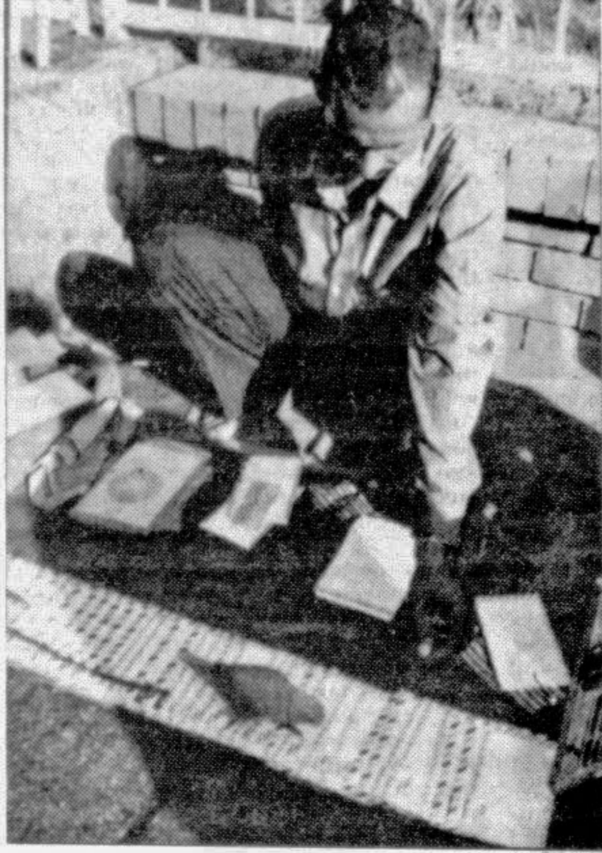
Parrot picks up your fortune!

The manager of this show sits on one side of a small mat or a plastic sheet. On the other side of this are spread out in neat arrangement all the many envelopes containing the fortune-telling messages. The green parrot sits atop the cage placed nearby. The bird can't fly away as its wings are partly clipped.