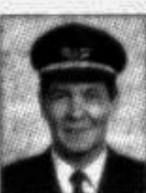
With our new fleet of spacious A320 aircraft and warm, professional in-flight service, you'll arrive refreshed and ready.

Dragonair flies non-stop to Hong Kong every Wednesday. A city where imposing mountains, towering skyscrapers and a breathtaking harbour combine to create an atmosphere like no other on earth. You can even fly on to China with our convenient daily connections. Or travel the world with our sister airline, Cathay Pacific. If you can ever bring yourself to leave Hong Kong, that is. For reservations please contact your travel agent or Dragonair at 812882, 868892 and 813003.