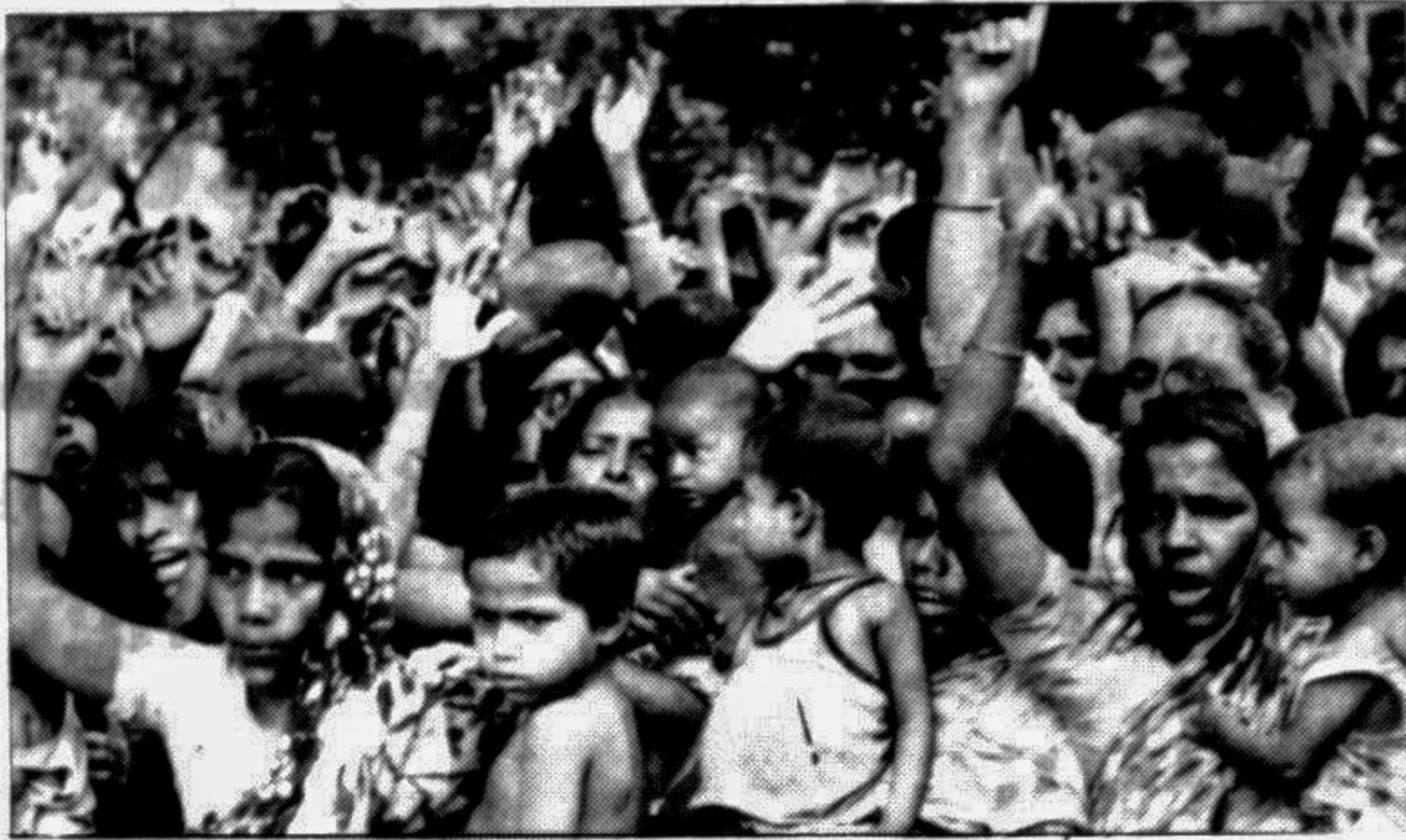
The Bangladesh Bastuhara Union brought out a procession in the city yesterday demanding their rehabilitation.