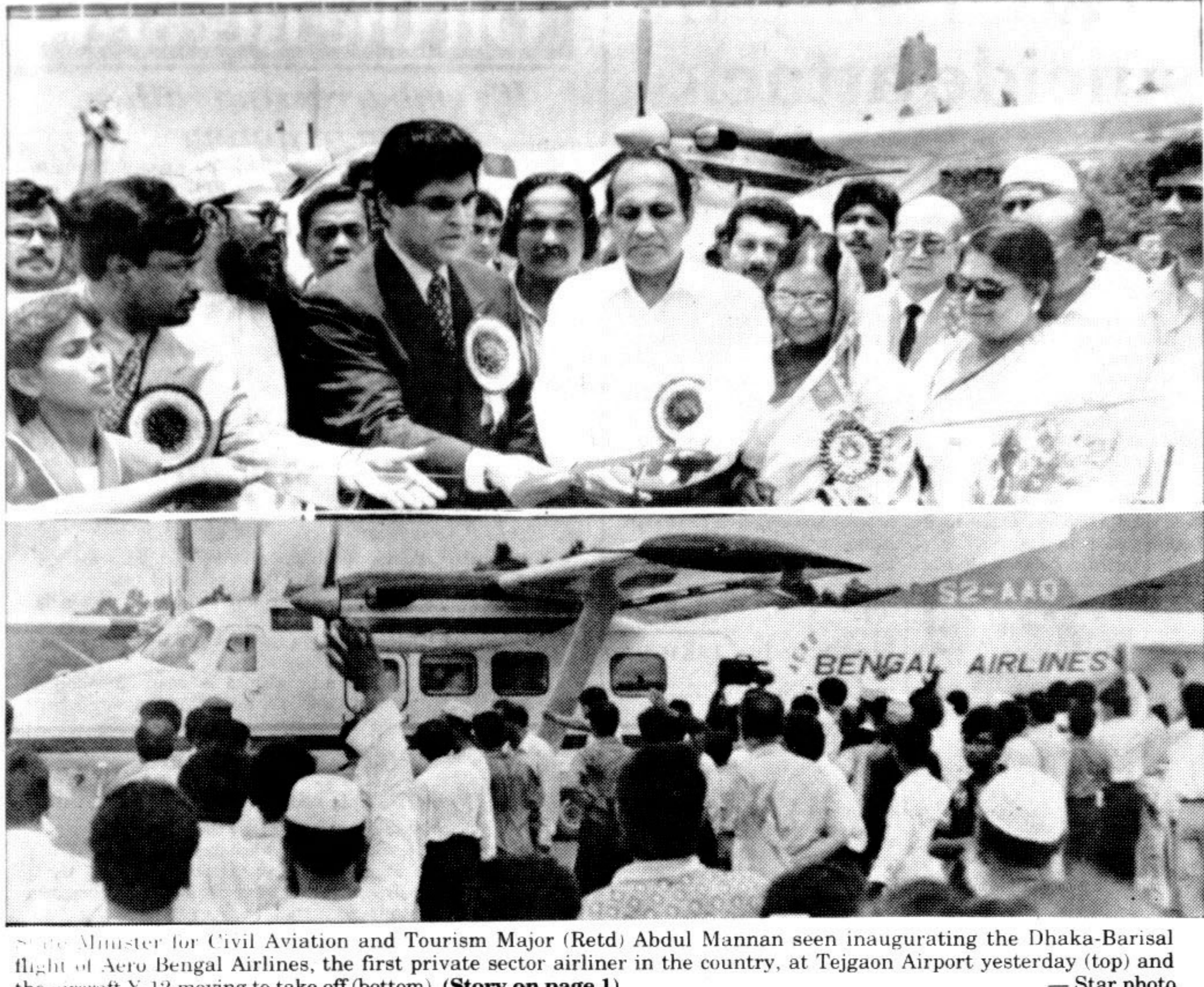
State Minister for Civil Aviation and Tourism Major (Retd) Abdul Mannan seen inaugurating the Dhaka-Barisal flight of Aero Bengal Airlines, the first private sector airliner in the country, at Tejgaon Airport yesterday (top) and the aircraft Y-12 moving to take off (bottom). (Story on page 1)