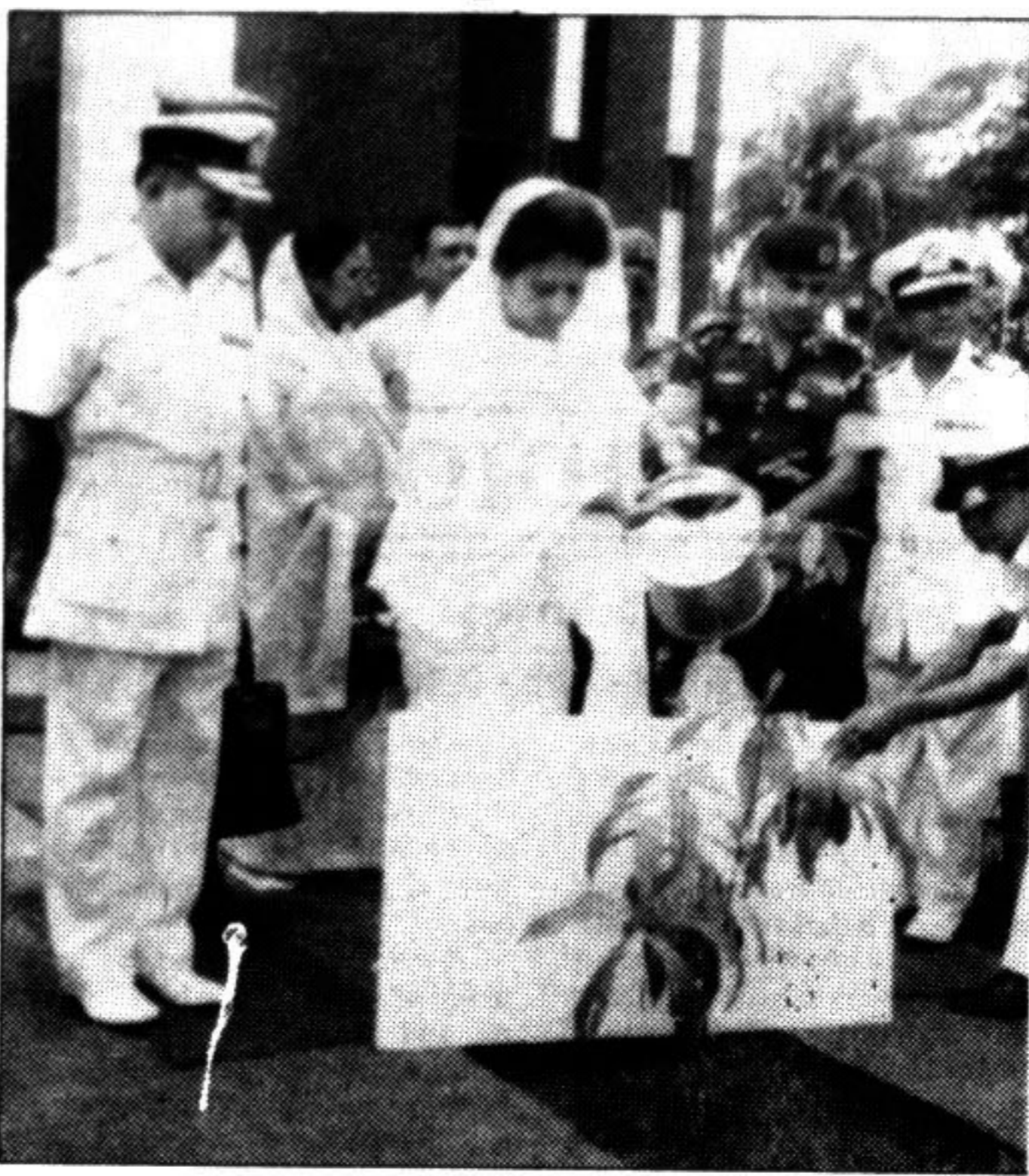
Prime Minister Begum Khaleda Zia inaugurated tree plantation campaign of the Bangladesh Navy by planting a sapling at the Naval headquarters at Banani yesterday.