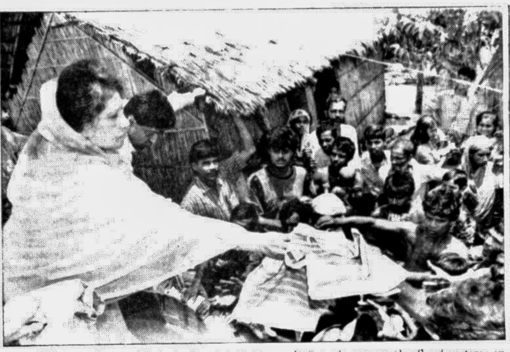
Prime Minister Begum Khaleda Zia distributing relief goods among the flood victims in Shibchar thana of Madaripur district yesterday.