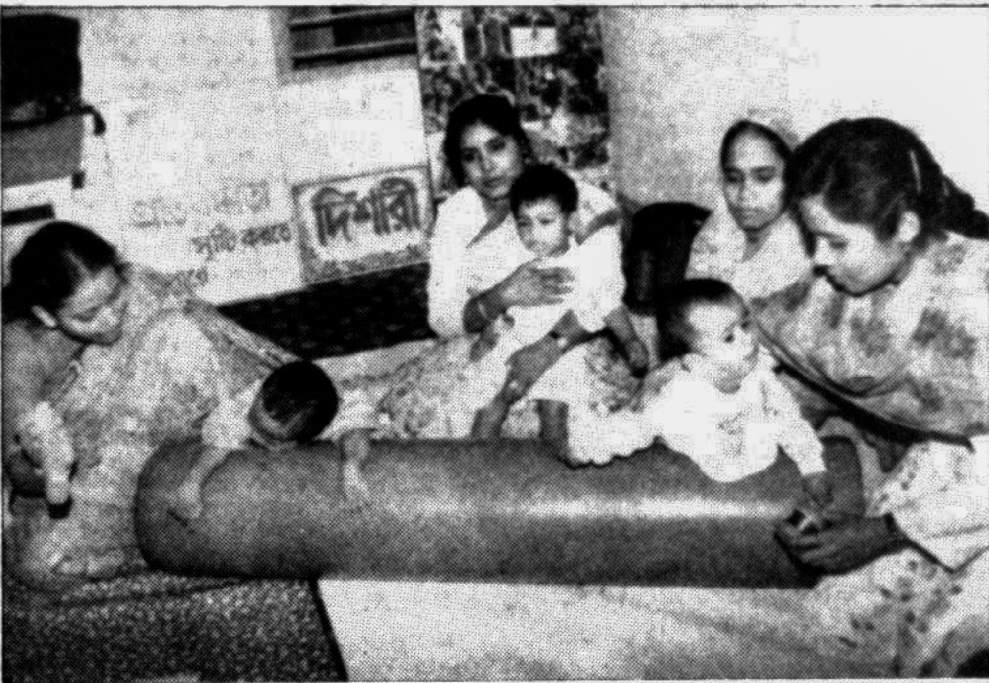
Mentally retarded children being taught at a private school Kalyani in the city

Disability in a person may take various forms. Some may be blind, others may be deaf or dumb. There may also be others who are physically handicapped. In our current thinking, all such disabled persons are not looked upon as useless. There are many examples which show them to be more active and able than normal human beings. We find a new concept of their potentialities which is designated as ability in a different way. In the light of the new definition, such disabled persons are no longer treated as a burden on society; they are rather regarded as equal partners in social development.