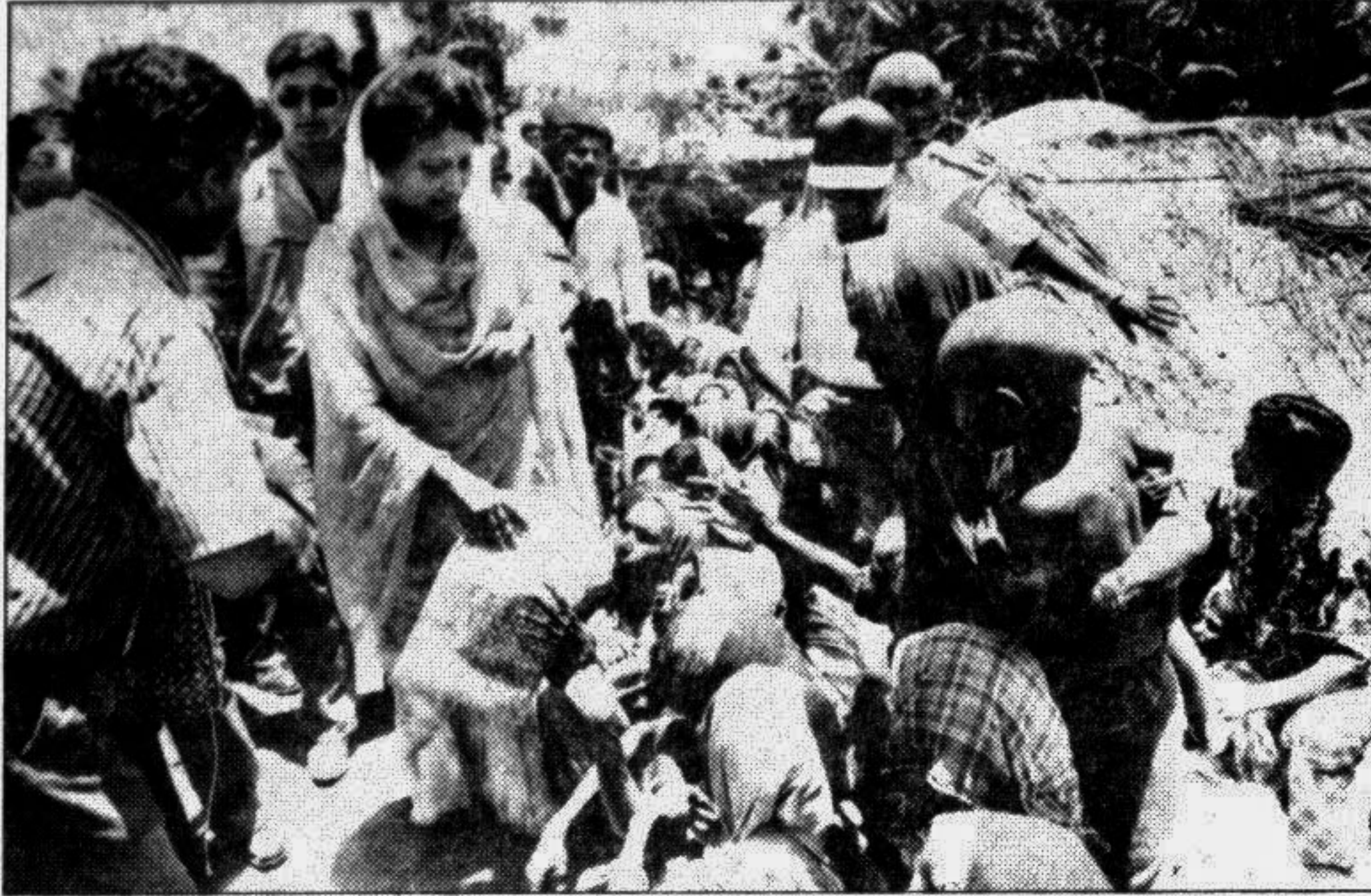
BOGRA: Prime Minister Begum Khaleda Zia distributing relief among the flood affected people of Sariakandi in Bogra on Wednesday.

Doctors attributed the spread of this water borne diseases for scarcity of safe drinking water.