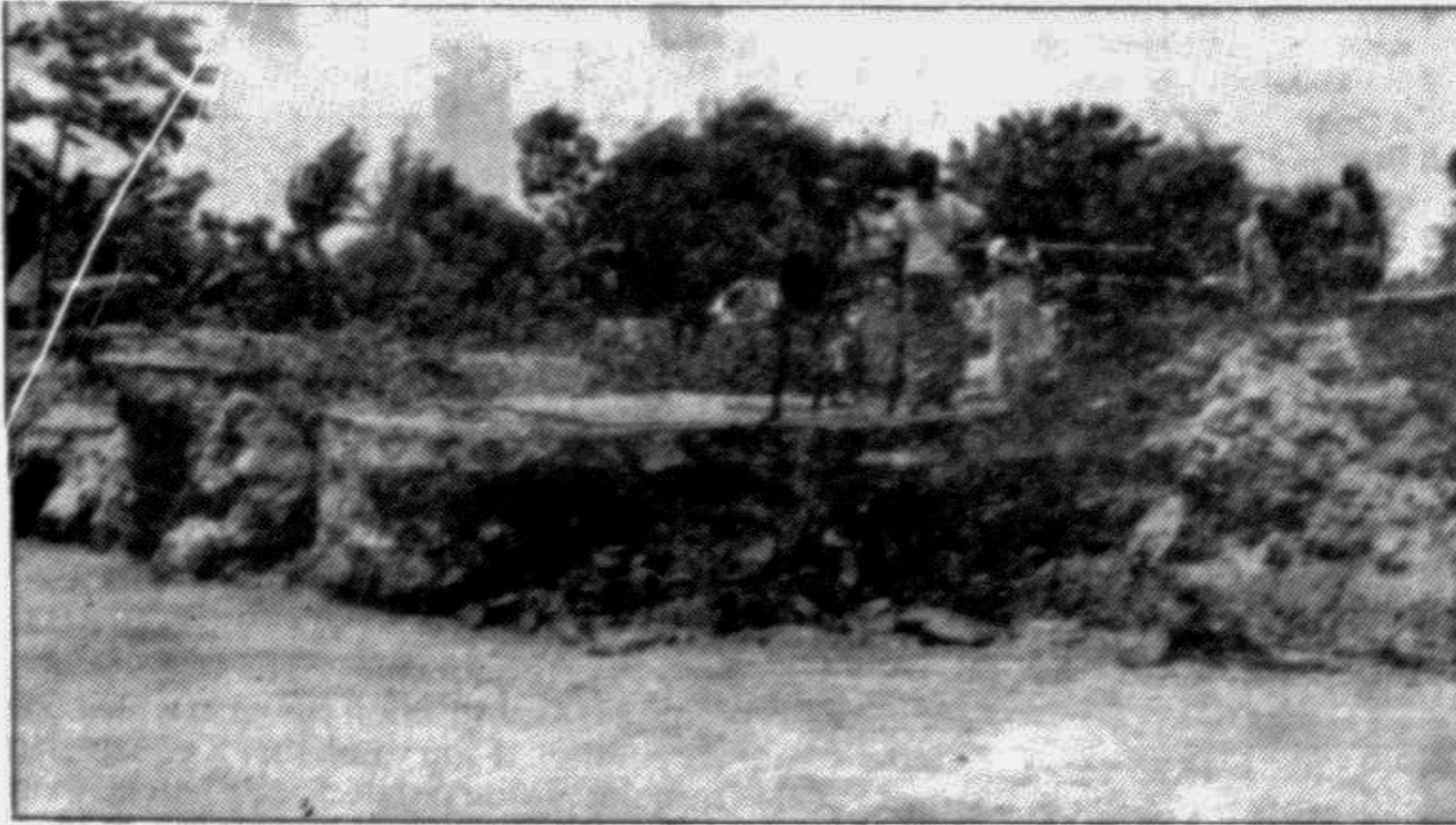
PABNA: People rendered homeless by flood, erosion search for new place to settle.

Ninety kilometres of road, 12 bridges and culverts were damaged partially by the onrush of flood water. About 1300 dwelling houses were completely damaged and 2,500 houses partially.