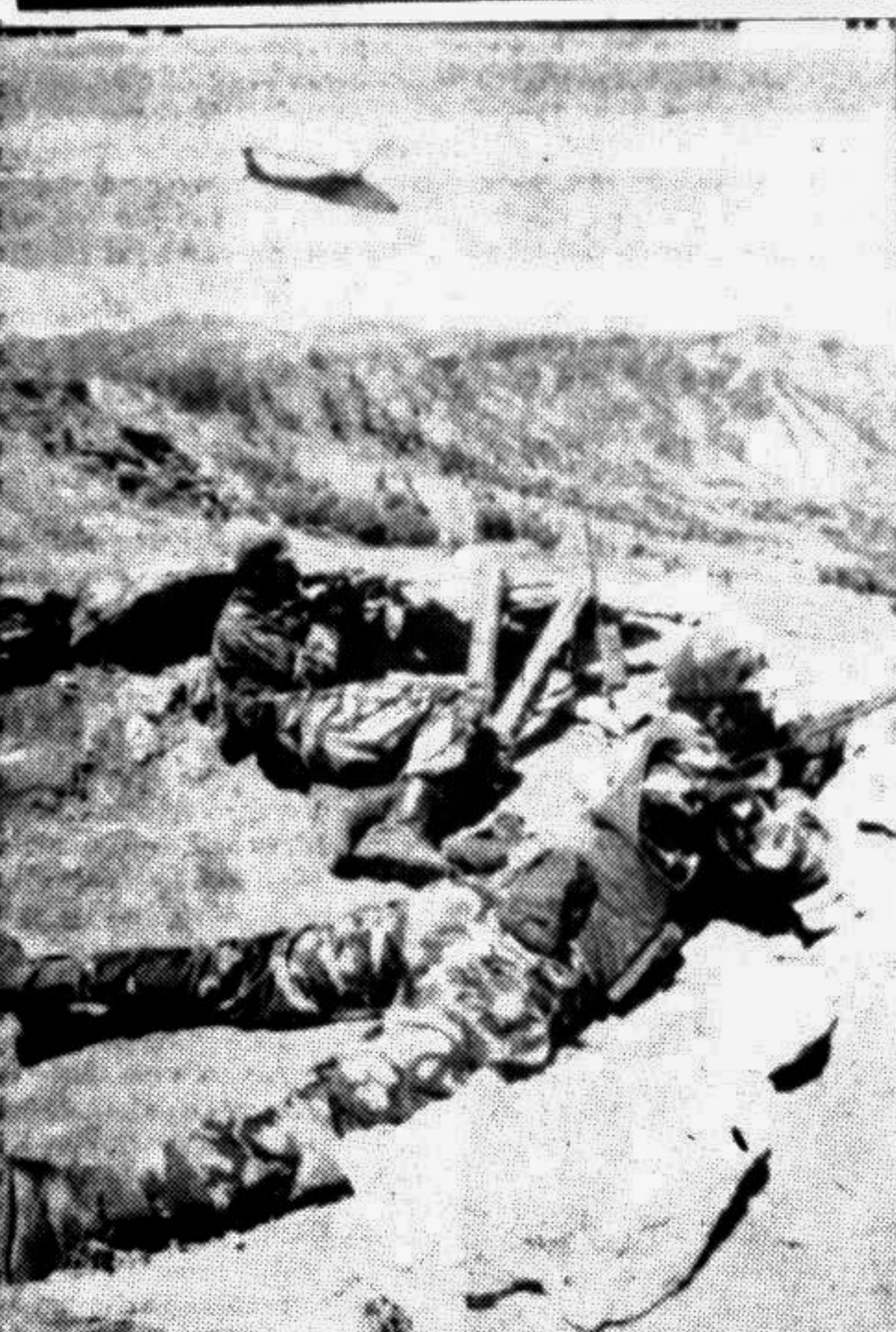
Turkish soldiers are on position as an army helicopter monitors the area some 20 km inside Iraq as the Turkish armed forces start a new crackdown operation on Kurdish PKK rebels in the Turkish-Iraqi border region on Tuesday. Reportedly 119 terrorists were killed and 33 were arrested in the operation.