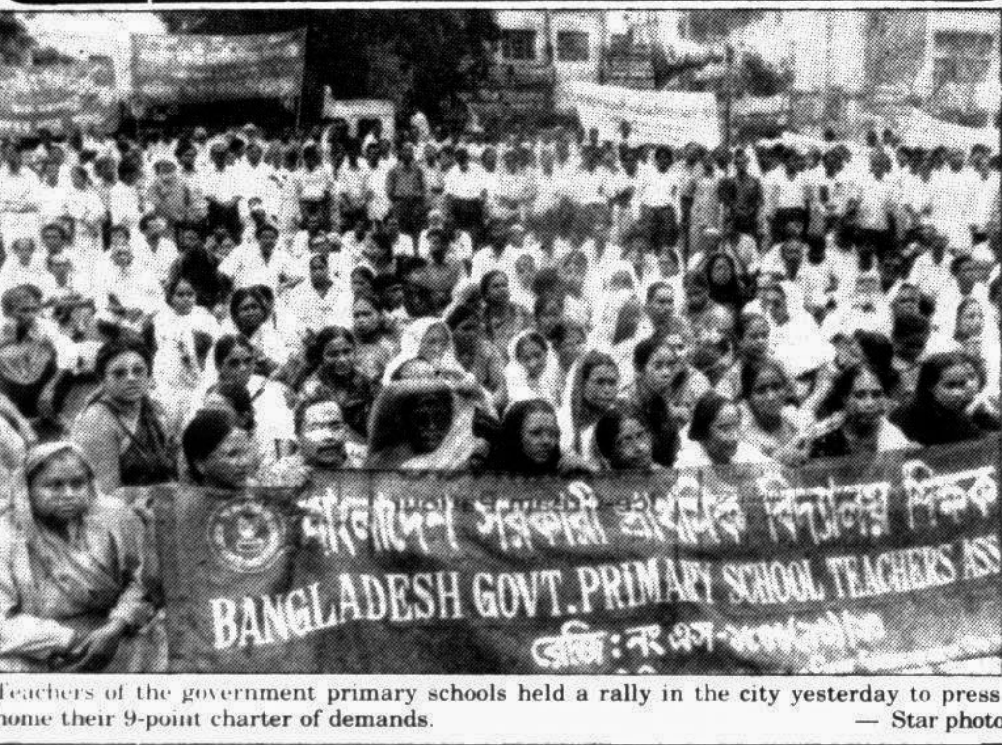
Teachers of the government primary schools held a rally in the city yesterday to press home their 9-point charter of demands.