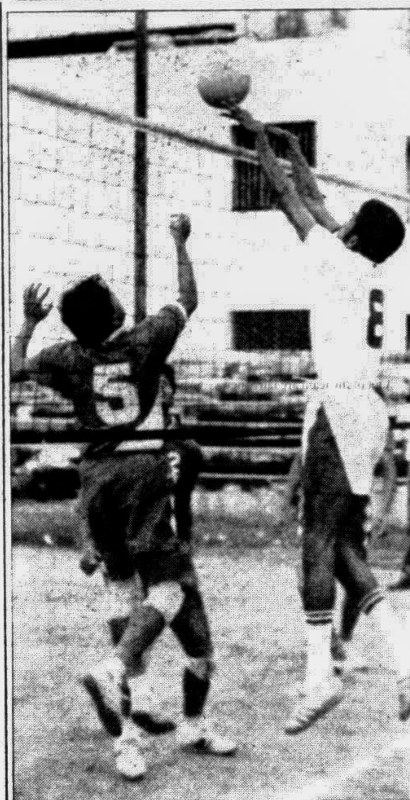
Action from the NBL Second Division volleyball league encounter between Dhaka Sabuj Club and East End Club at the court adjacent to the Dhaka Stadium yesterday. Dhaka Sabuj won the match 15-3, 15-5, 15-9 to become champions.