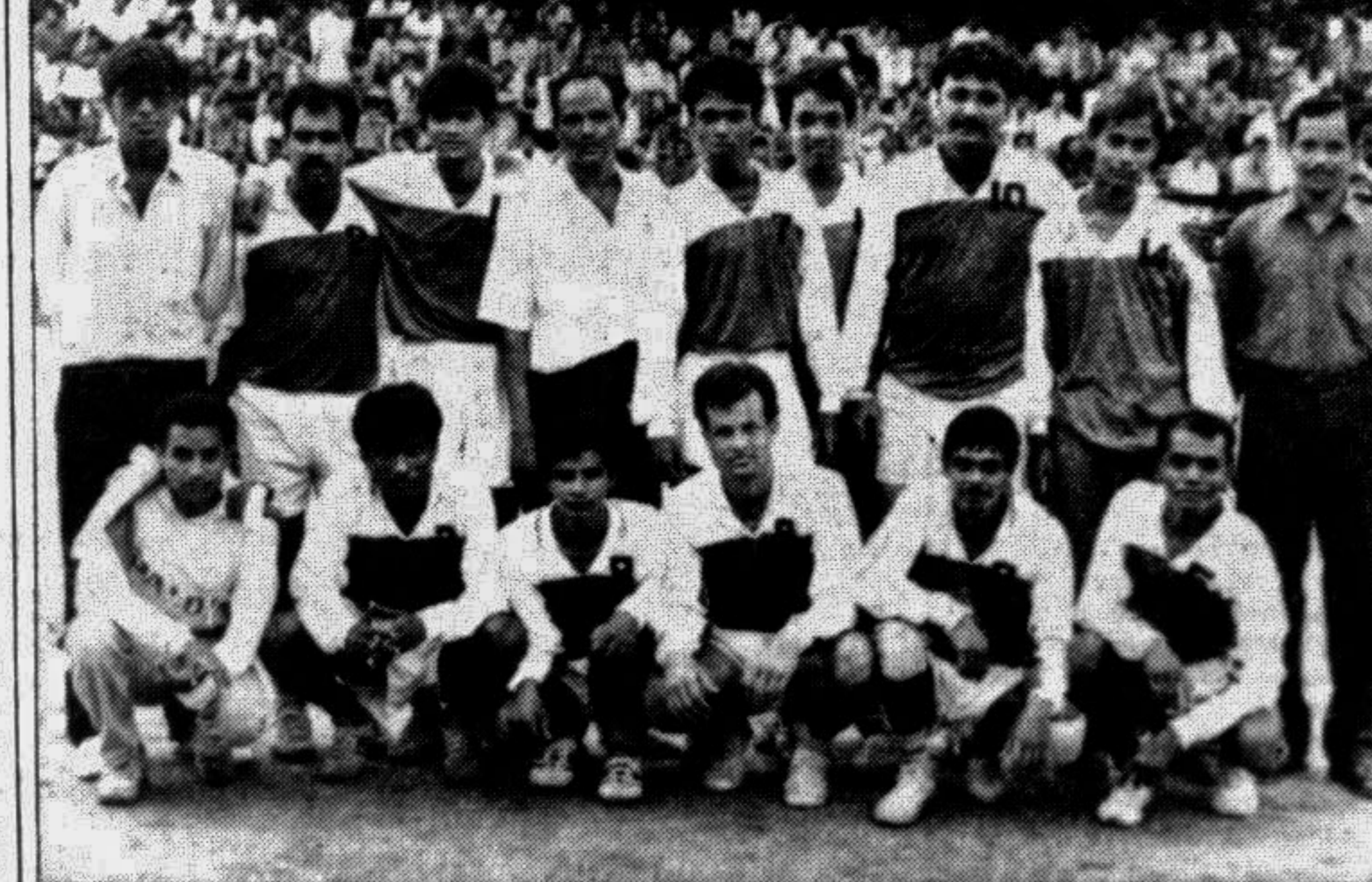
SPRITILY SPIKERS: Nabajatok Majlish became the unbeaten champions of the NBL Second Division volleyball league yesterday.

But Becker's first Wimbledon triumph as a teenager in 1985 and Graf's continued success at the championships fuelled the tennis boom of the 1980s. It will be difficult for any new German to match their impact on the domestic game. The nation enjoyed watching the two stars grow up. Becker into a dotting father and Graf into a successful model whose looks have been used to advertise everything from pasta to deodorant. Parting would be such sweet sorrow. But the biggest-selling newspaper Bild said: "Boris, we are crying with you ... millions of people went through your nerves and your hopes yesterday, in vain."