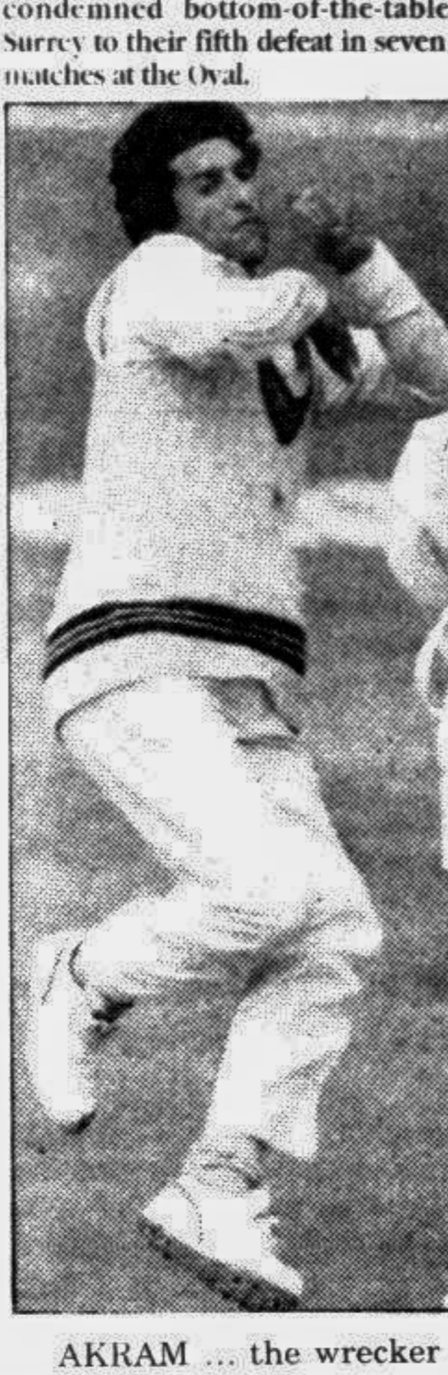
AKRAM ... the wrecker