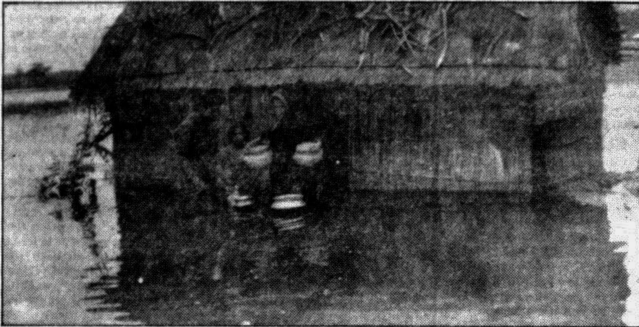
SHERPUR: Members of a flood-hit family of Shahabdir char village under sadar thana moves for a safer place following the inundation of their dwelling. The picture was taken on Sunday.

Padma, Jamuna in Pabna continued to over flow. The water level in both the rivers was flowing one metre above danger mark, according to reports received on Monday. Road link in many areas of Naogaon district was cut off. Reports received from districts also said flood situation in Gaibandha, Tangail and Faridpur further worsened as water level in rivers continued to rise.