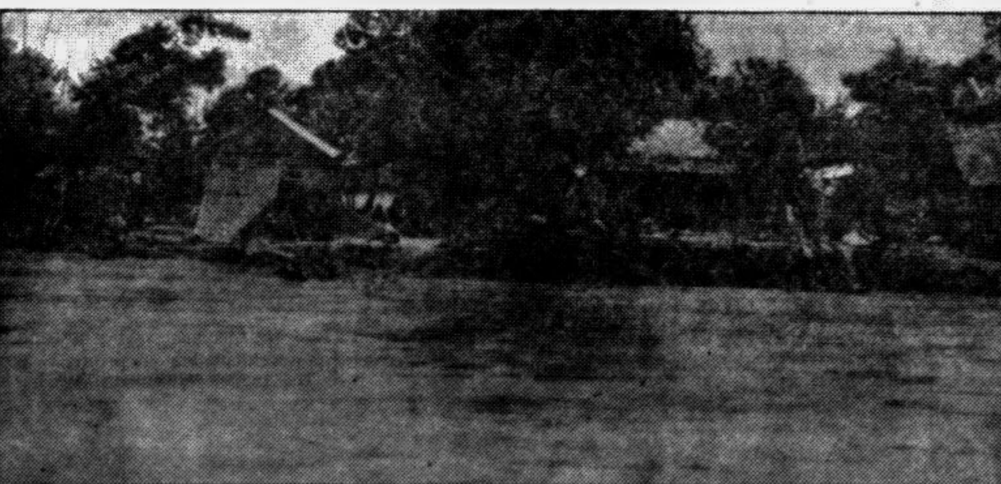
PABNA: Scene of a flood affected village under Bhangora thana.