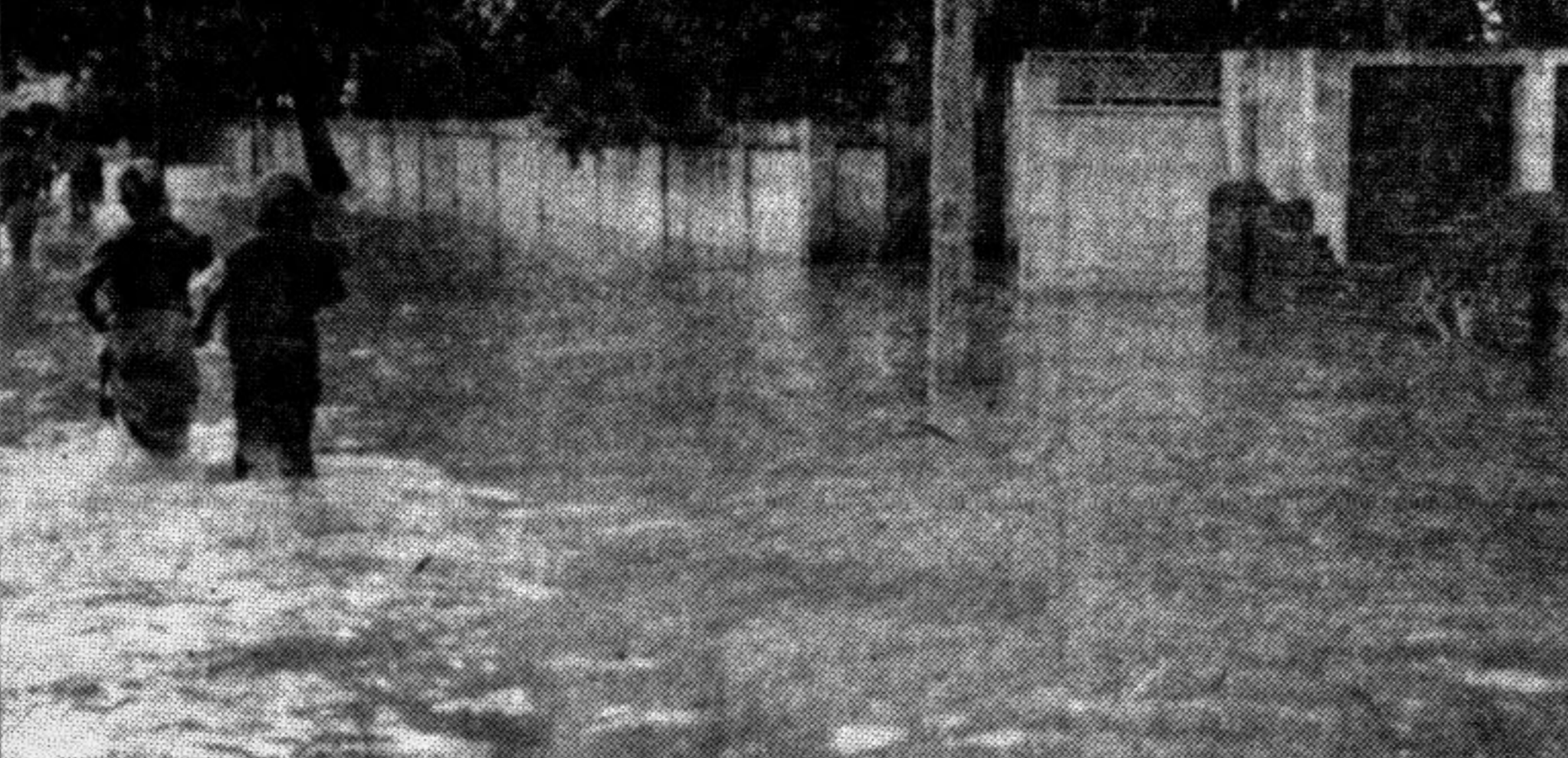
GAIBANDHA: The residence of Deputy Commissioner, Gaibandha has been inundated in the recent downpour.