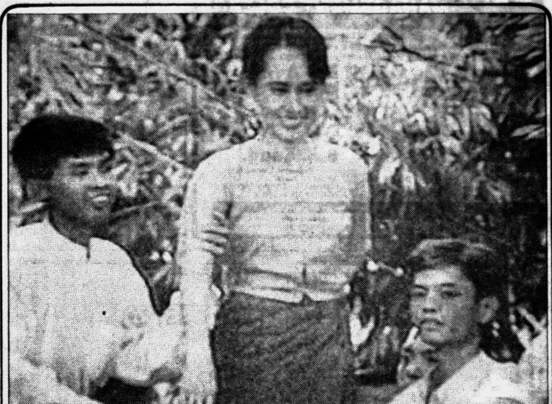
Myanmar opposition leader Aung San Suu Kyi appearing in public after a press conference yesterday at her residence in Yangon.

Before the prorogation order of See page 12 Col 3