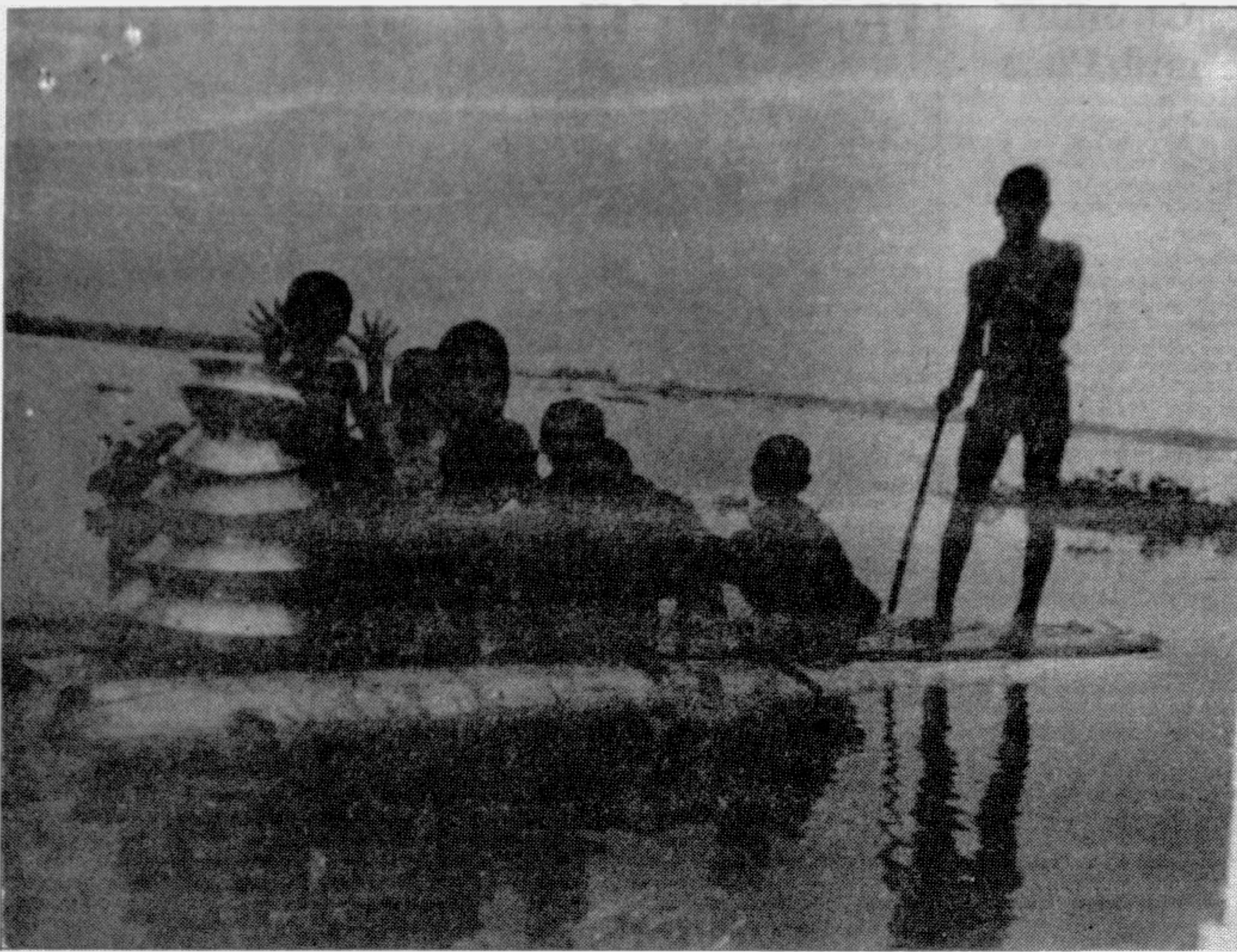
JAMALPUR: A flood-hit family in village Adra of Melandah thana moves for a safer place with all the things they could carry.