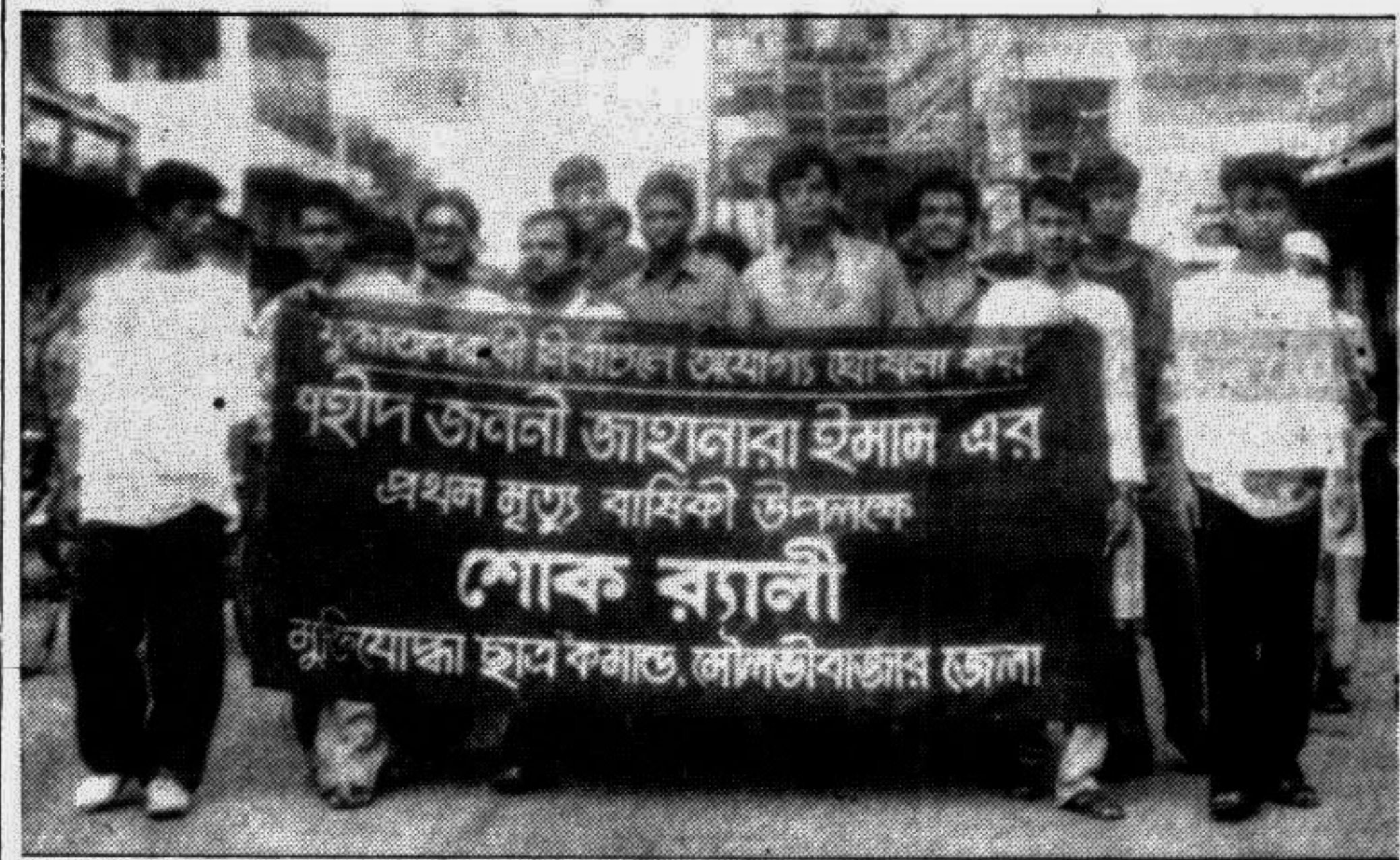
MOULVIBAZAR: Muktijuddha Chhatra Command, Moulvi Bazar unit brought out a mourning procession marking the first death anniversary of Jahanara Imam.

It is to be mentioned here that crimes and all types of offence have remarkably decreased in the city just after the inception of Rajshahi Metropolitan Police in 1992 and the civic life were more or less peaceful during last three years. Political unrest and clashes were the exceptions. But all types of crimes have recently increased making people anxious.