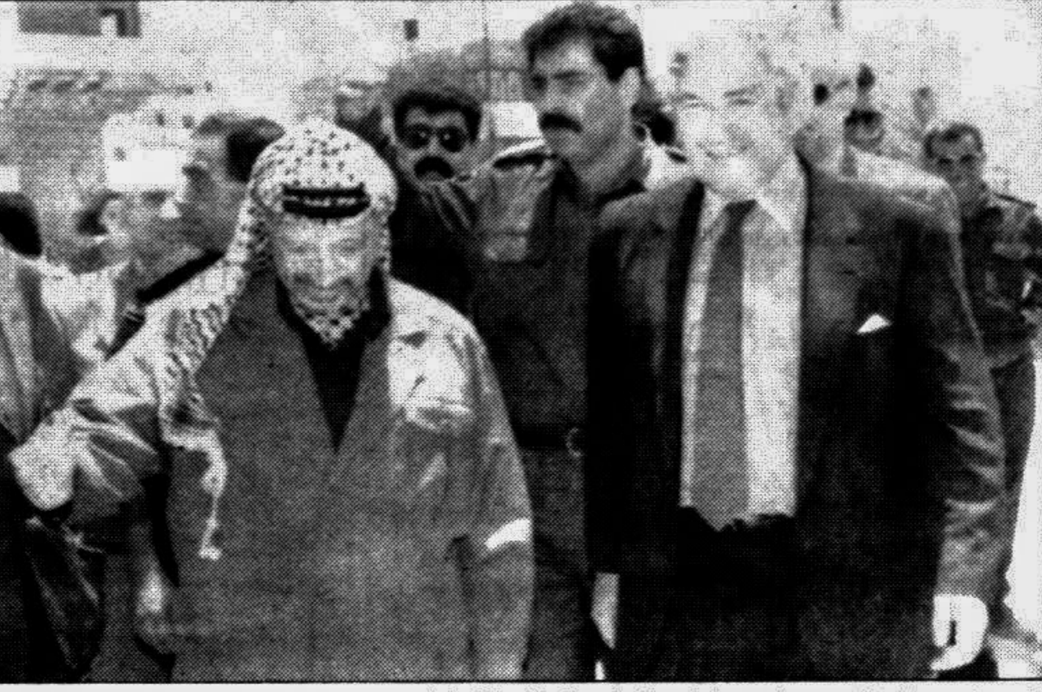
PLO leader Yasser Arafat tours with World Bank President James Wolfensohn (R) the beach of Gaza City Sunday. The World Bank granted a 20 million US dollars aid to the Palestinian authority through an agreement signed between Arafat and Wolfensohn.

DAMASCUS, July 10: Syria today rejected out of hand any Israeli presence on its territory as part of a peace deal ahead of a new Middle East shuttle mission by US envoy Dennis Ross, reports AP.