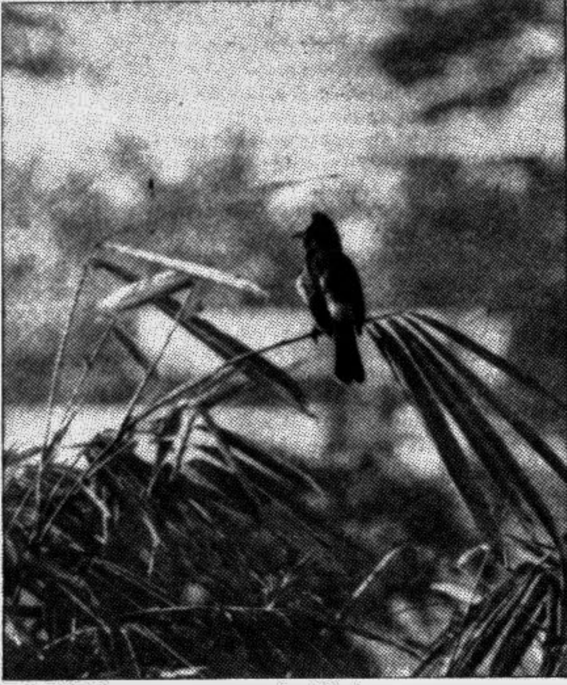
A sight becoming rarer in Dhaka.