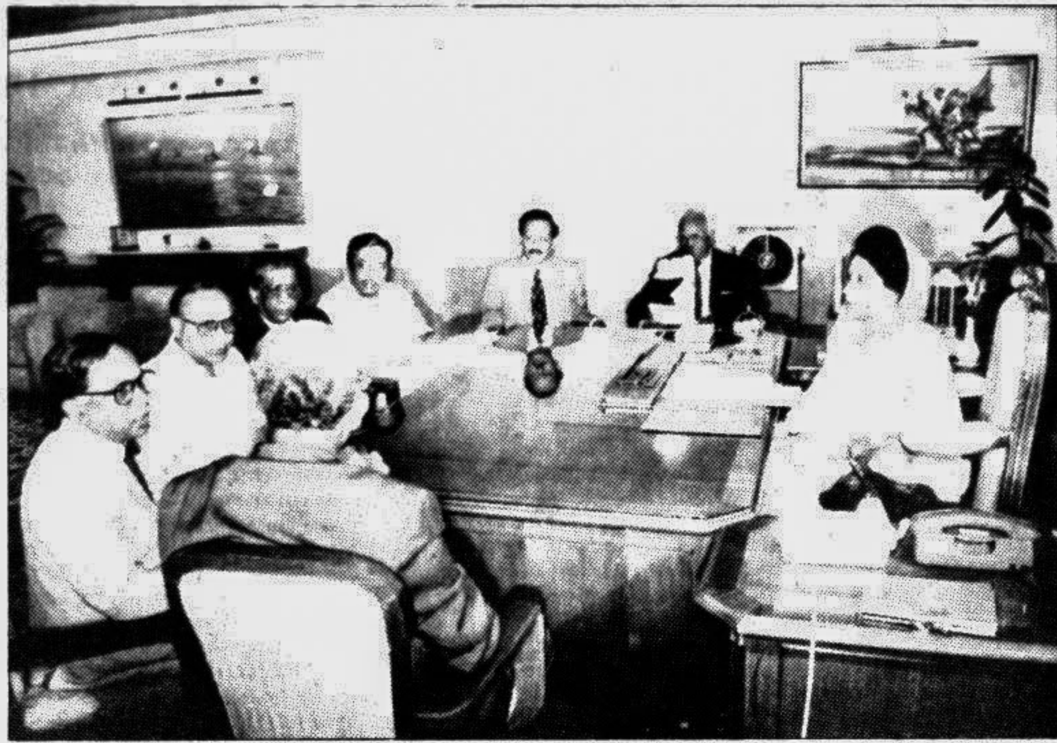
Prime Minister Begum Khaleda Zia presiding over a high-level meeting held at her office yesterday to review the flood situation in the country and rescue and relief operation in the affected areas.