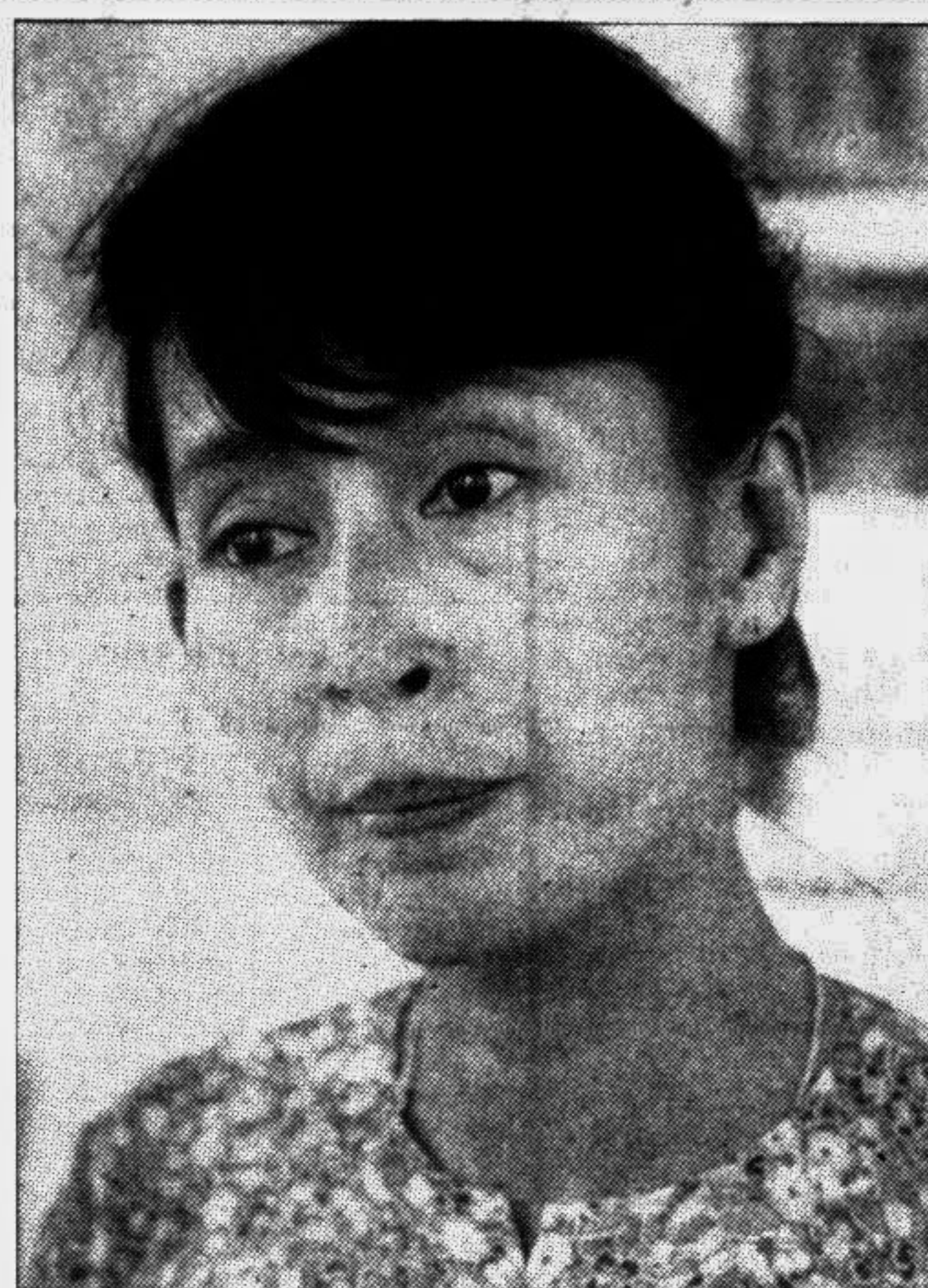
Aung San Suu Kyi.