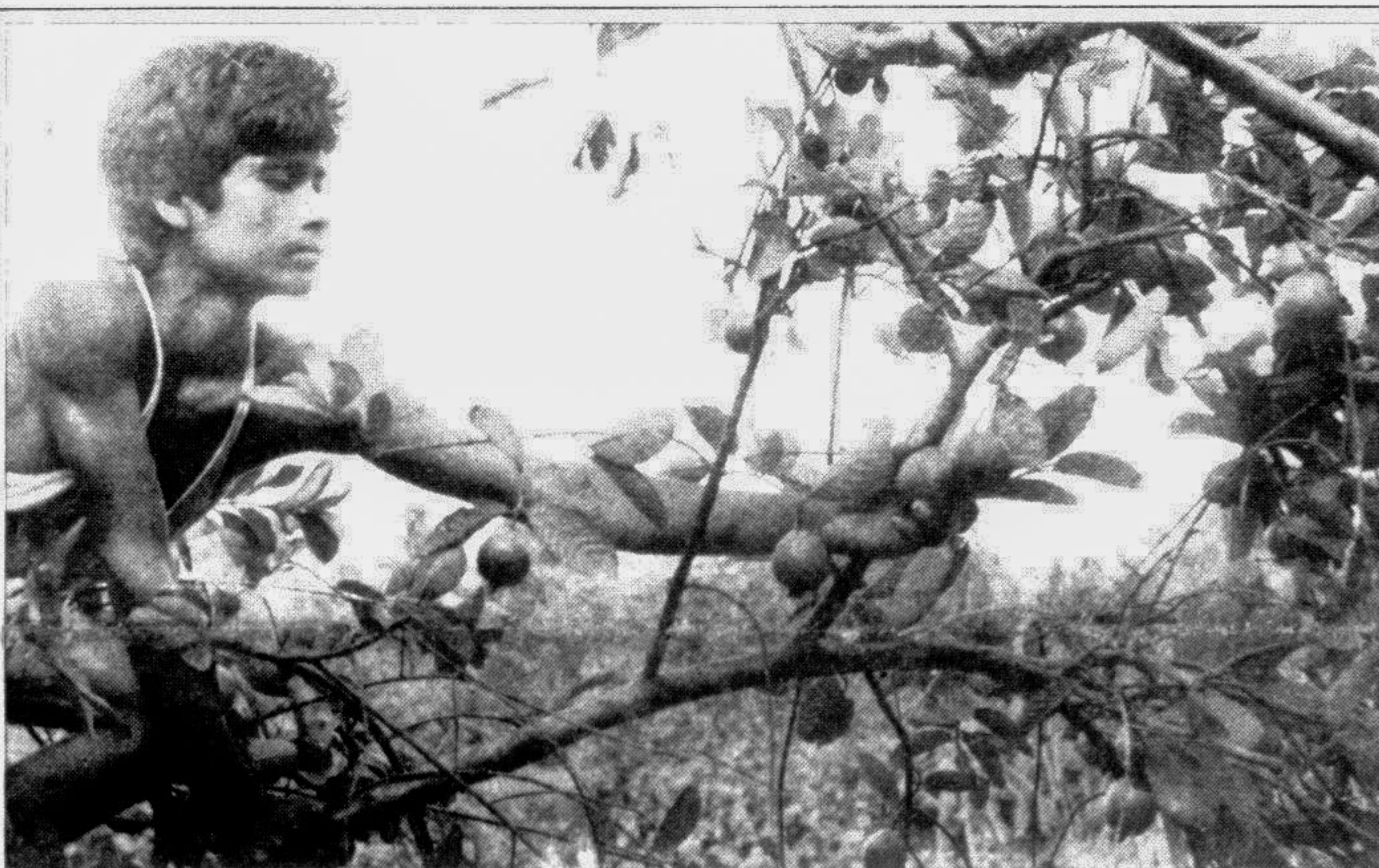
The peak season of delicious guava is only days away.

In the wake of incessant rain and onrush of waters from the upstream parts of Sirajganj town also went under water while fresh areas in three thanas of Bogra district were inundated as the Jamuna continued to See page 12 Col 7