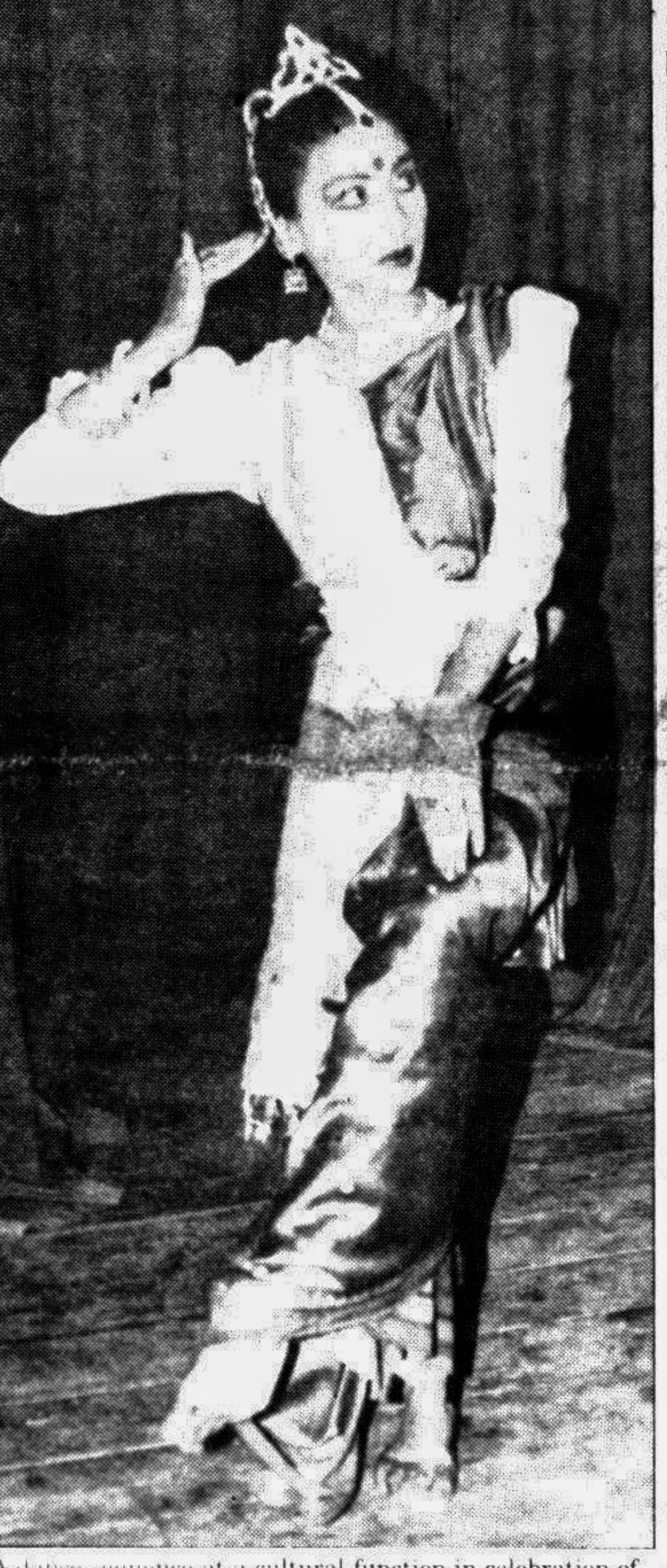
A dance sequence at a cultural function in celebration of Nazrul Jayanti at the Shilpakala Academy auditorium in the city yesterday.

By Staff Correspondent Finance Minister M Saifur Rahman has said steps will be taken against irregularities in the Dhaka Stock Exchange (DSE) to protect interest of small investors. "I shall look into the secondary market to make it transparent and through regulations, stop irregularities and manipulation of share prices," the minister said while addressing a seminar on capital market organised by the Bangladesh Share Investors Forum (BSIF), a body of small share investors of the DSE here yesterday. "There is an unhealthy trend in the DSE where brokers are acting as managers and exorbitant biddings over unused seats made." He called for filling up the unused seats immediately. "I am always on the side of the small investors. They play the most vital role in quality investment in the country's economy," the minister said.