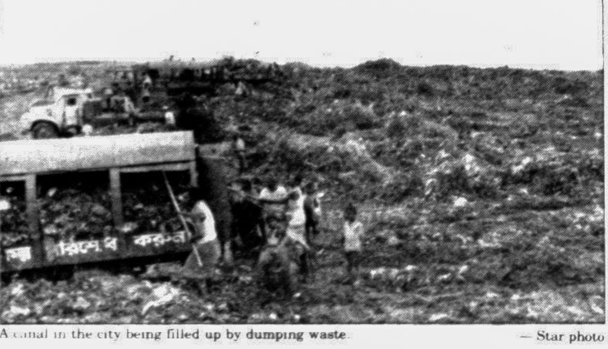
A canal in the city being filled up by dumping waste.

By Morshed A Khan and Krishna P Roy Gradual disappearance of water reservoirs and low-lying areas from the city is already posing enormous problems for fire fighters, according to an official of the Fire Service and Civil Defence. During a recent fire incident at a shop at Elephant Road, fire fighters had to fetch water from a pond in Dhaka University area, quarter kilometre away, he said. "Such a situation may cause great disasters," he said. "Most of the water reservoirs have disappeared over the last ten years." In case of a big fire, we have to pump water from a reservoir nearby. But now a days, we face serious difficulties due to lack of natural water reservoirs," he said. "In the city's surrounding areas also, plots are being elevated and industries set up there without ensuring fire fighting facilities. This is a helpless situation." In the process of filling up the low-lying areas, 'precious' top soil of the adjacent areas of the city are being removed which is not environmentally sound, said an official of the Department of Environment (DOE). Low-lying lands and open space not only serves as water retention places in the city. Those also help growth of a healthy society, according to professionals. If the present trend of filling up the open spaces continues, the city will soon lose all the vital facilities for a decent living too, experts said.