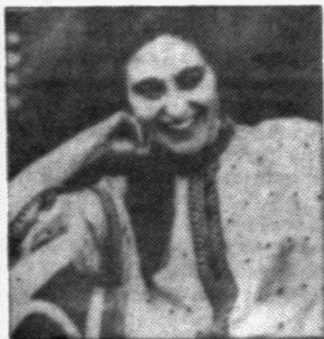
Ruth Praver Jhabvala

"SOMEONE once said that the definition of the highest art is that one should feel that life is this and not otherwise. I do not know of a writer living who gives that feeling with more unqualified certainty than Mrs Jhabvala," wrote C P Snow and the Sunday Times described her as, "a writer of genius... of world class — a master story-teller."