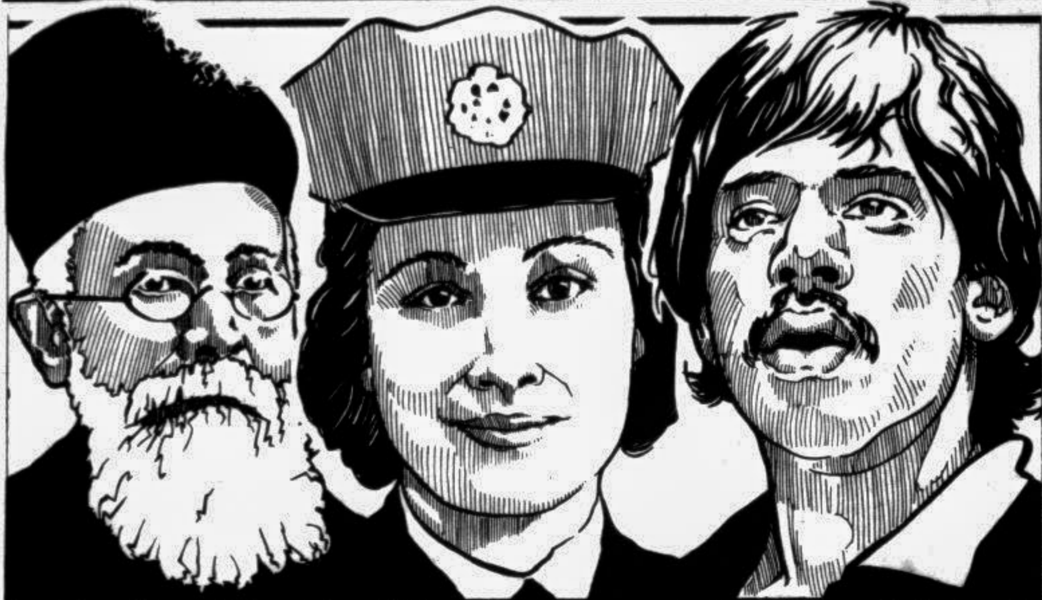
Dadabhai Naoroji, first Asian MP in Britain; Noor-un-nisa Inayat Khan, British spy in Nazi-occupied Paris; and world squash champion Jahangir Khan

WHAT have pop stars Freddie Mercury and Apache Indian in common with cricketer Ranji-tishiji and radar pioneer J C Bose? They are all Asians who, like scores of others, have made their mark in Europe.