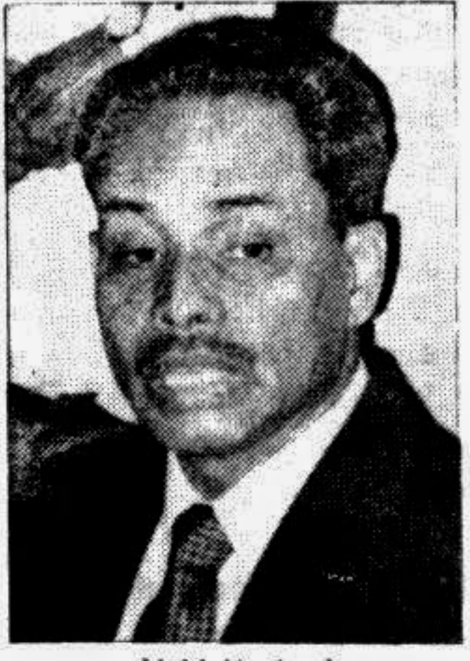
H M Ershad