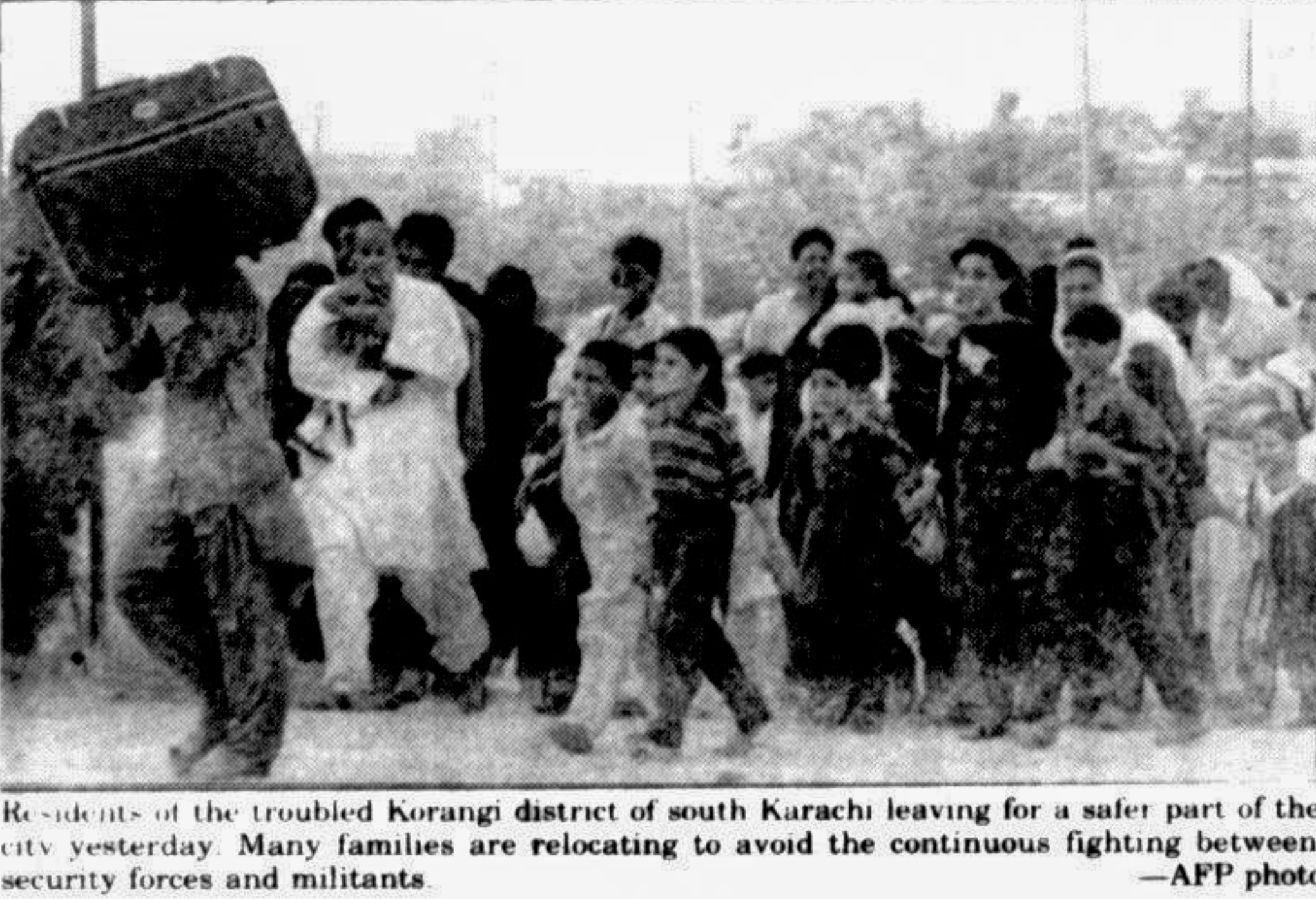
Residents of the troubled Korangi district of south Karachi leaving for a safer part of the city yesterday. Many families are relocating to avoid the continuous fighting between security forces and militants.