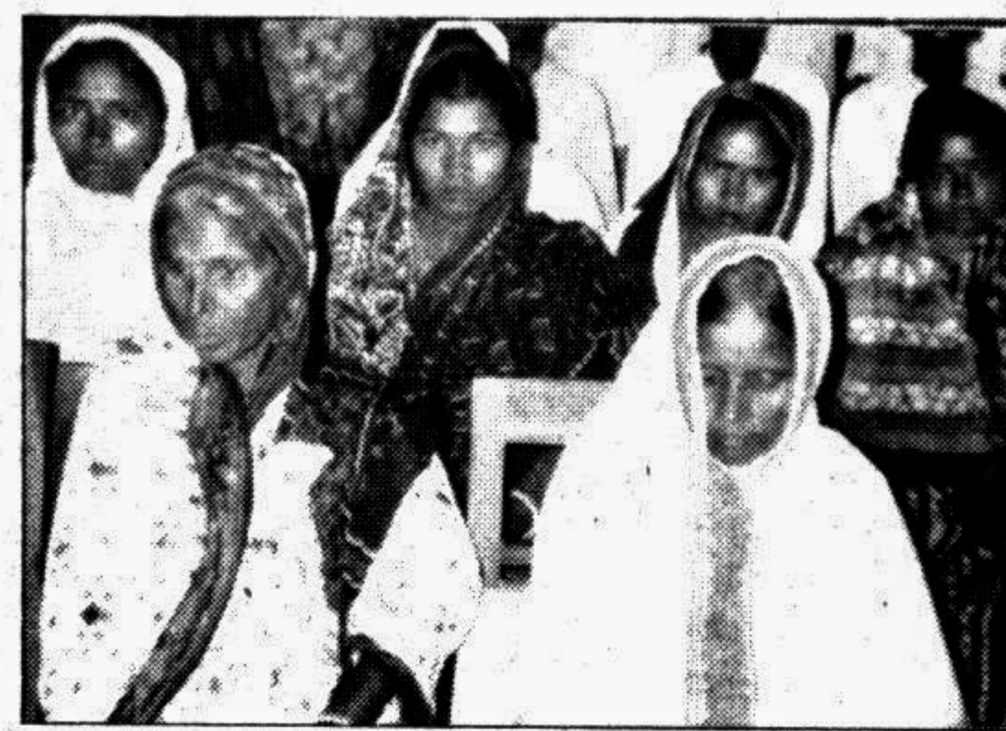
JHENIDAH: Members of Mahila Bittahin Samabaya Samiti are given training on various projects by BRDB. The picture shows a class of the society members taking lessons on Family Planning.