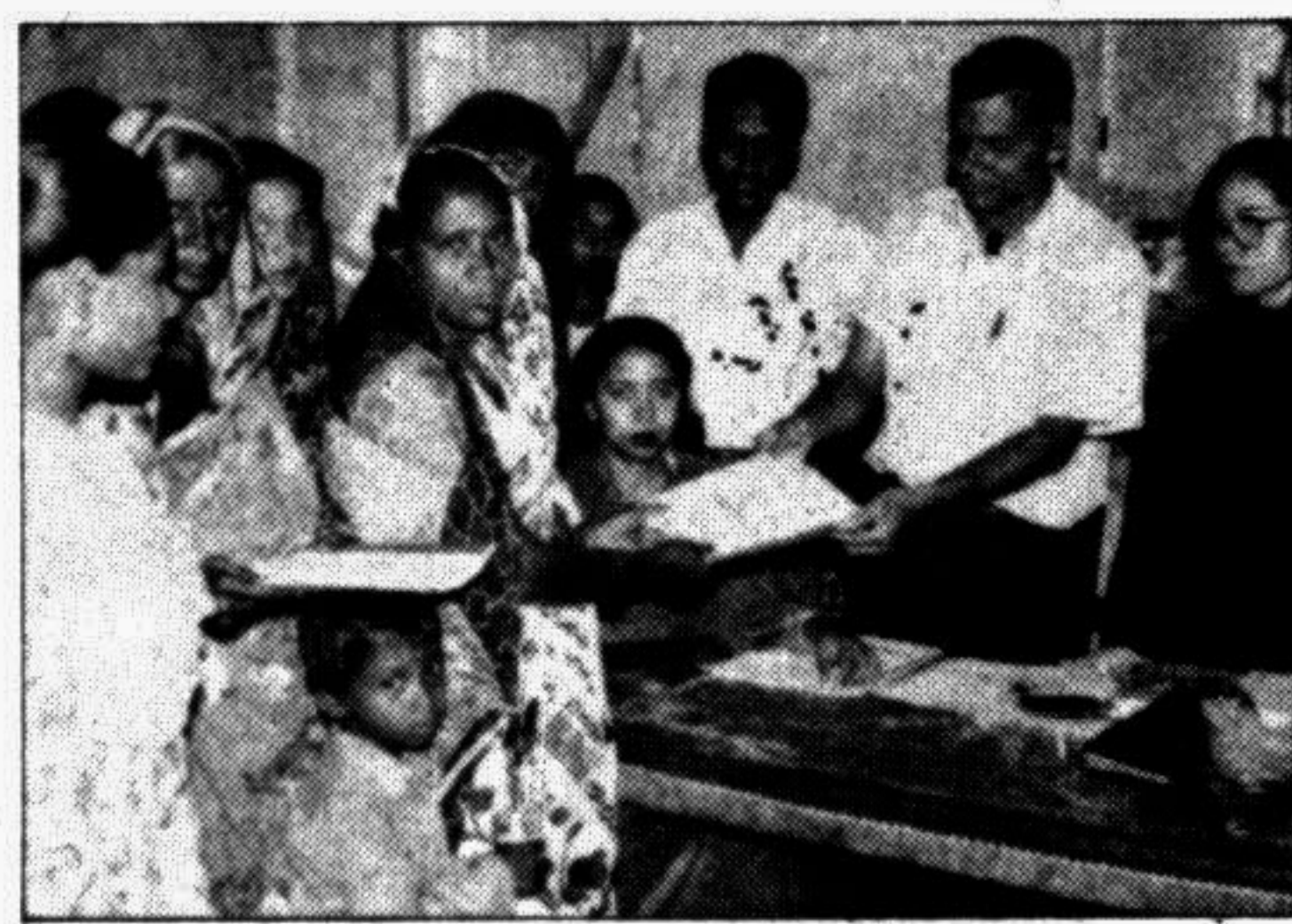
NATORE: Handbooks of fisheries training being distributed among poor women as a part of WEDP in Natore.

NATORE, July 5: Women Entrepreneurs Development Programme (WEDP) of Bangladesh Small and Cottage Industries Corporation (BSCIC) has started its operation in Natore on March 27, 1993 with a view to improve living condition of distressed, helpless and socially oppressed rural women as a part of its countrywide programme through socio-economic and cultural development projects.