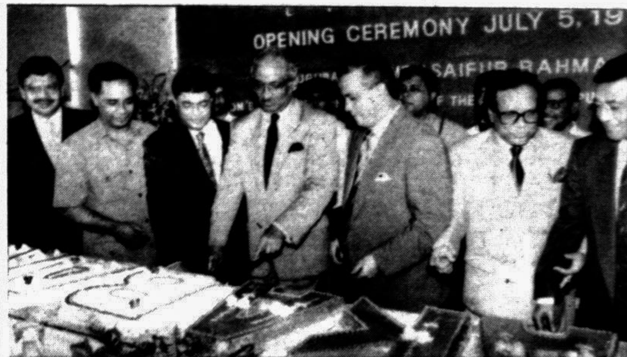
Finance Minister M Saifur Rahman seven inaugurating the operation of Dhaka Bank Ltd by cutting cake at Motijheel Commercial Area in the city yesterday. Jute Minister ASM Hannan Shah and Bangladesh Bank Governor Khorshed Alam attended the function.