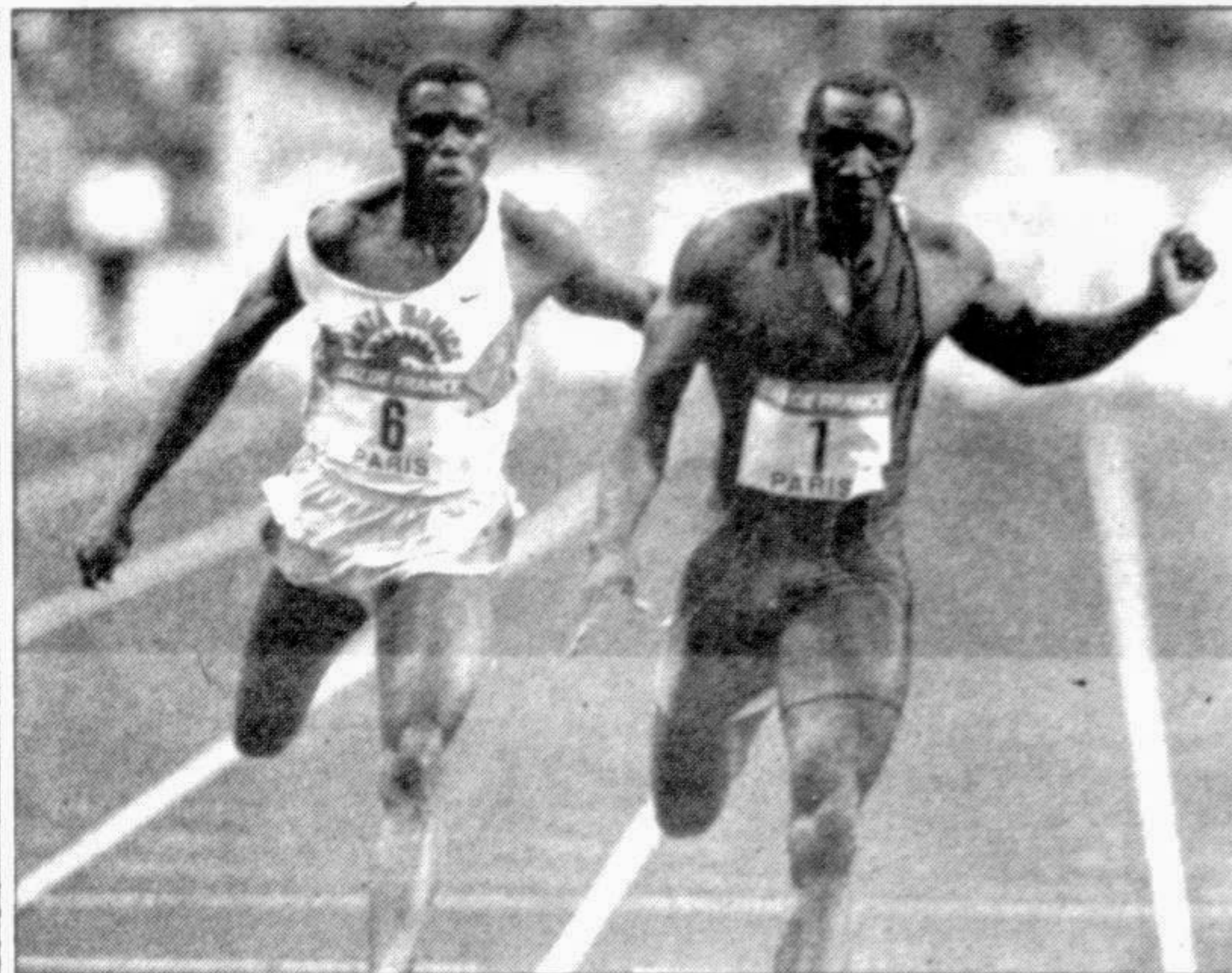
Defending Olympic champion Linford Christie (R) of Britain crosses the line ahead of his American rival Carl Lewis to win the 100 metre dash of the Paris track and field meet on July 3. The 35-year-old Briton clocked 10.06 seconds.