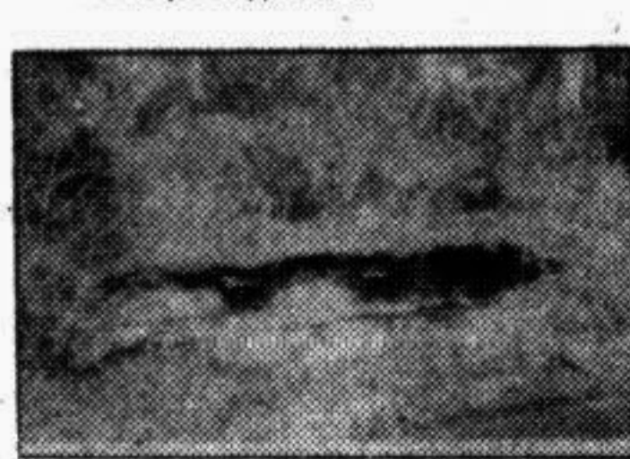
NATORE: Such big holes have developed in many parts of the roof of Rani Bhabani.

NATORE, July 4: The famous Rani Bhabani Palace of Natore is gradually turning into ruins. In the absence of proper maintenance, floor, roof, walls and engravings of the palace is collapsing fast.