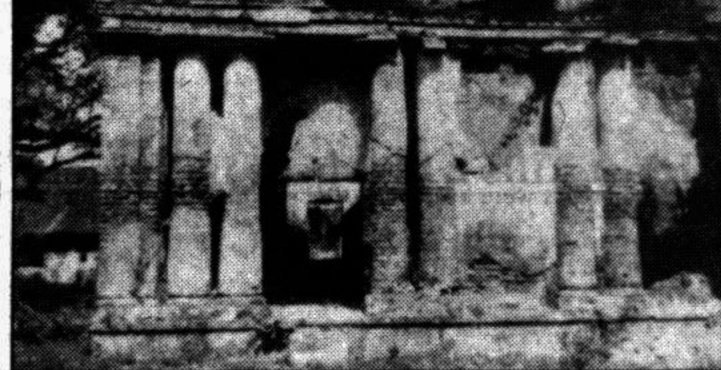
NATORE: The deplorable condition of Rani Bhabani.

In 1985 the then DC of Natore made Jubo Park in areas surrounding the palace. Being open to all, valuable marble stones placed on the floors are being stolen. Besides statues and other ornamental designs are also in the process of ruination.