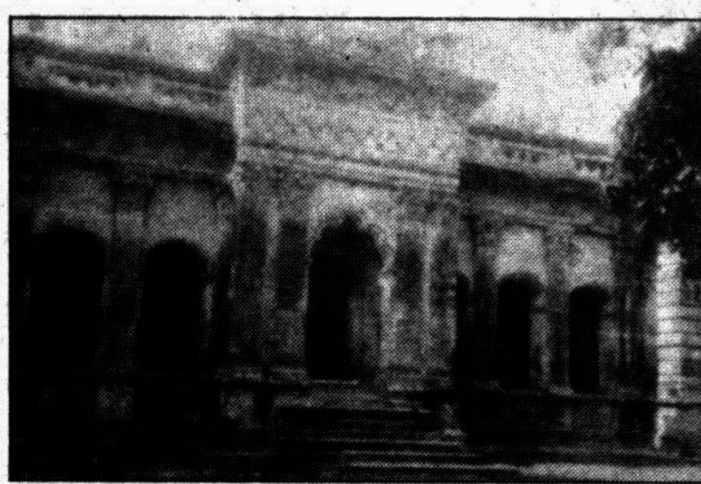
NATORE: The marble stones of the eastern staircase have been stolen.

The huge surplus of her revenue income enabled her to