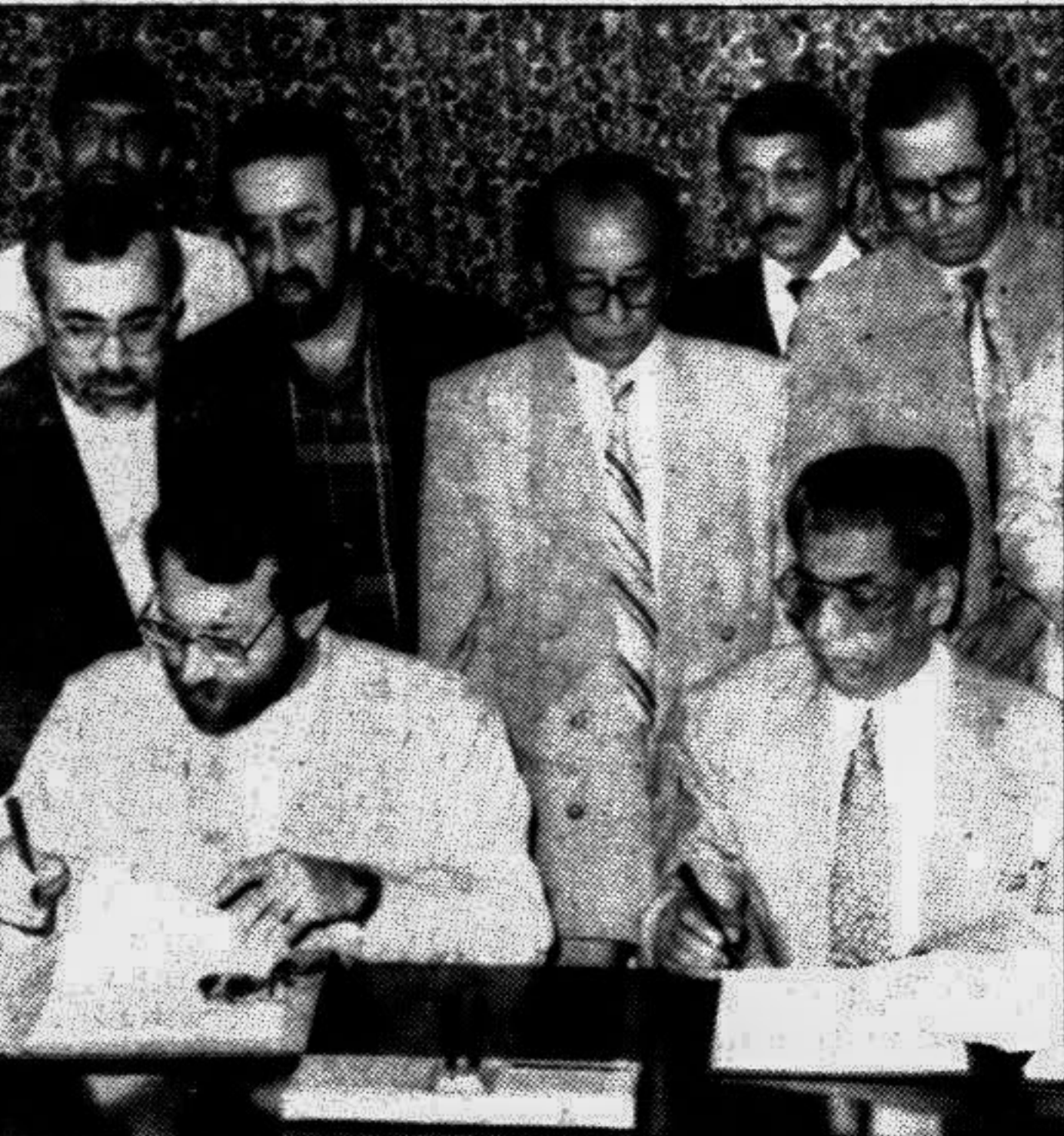
Commerce and Information Minister M Shamsul Islam and visiting President of the Islamic Republic of Iran Broadcasting Dr Ali Larijani signed an agreement on exchange of information between the two countries at the State Guest House Meghna in the city yesterday.