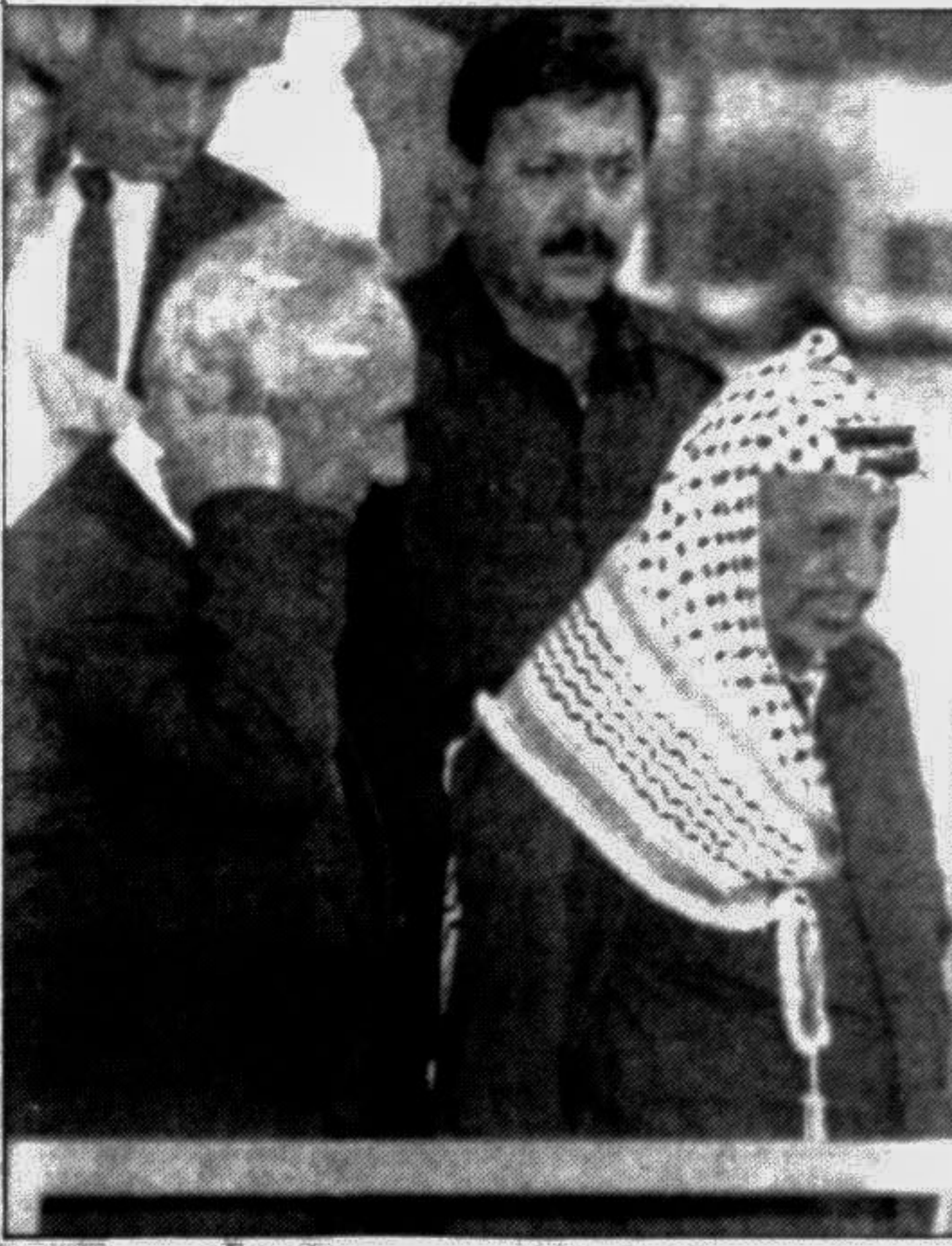
Palestinian leader Yasser Arafat (R) and Israeli Foreign Minister Simon Peres walking out at dawn yesterday after an 8.5-hour meeting in Erez. The two men broke up a whole night of talks admitting they had failed to strike a deal to extend autonomy. (Story on page 8).