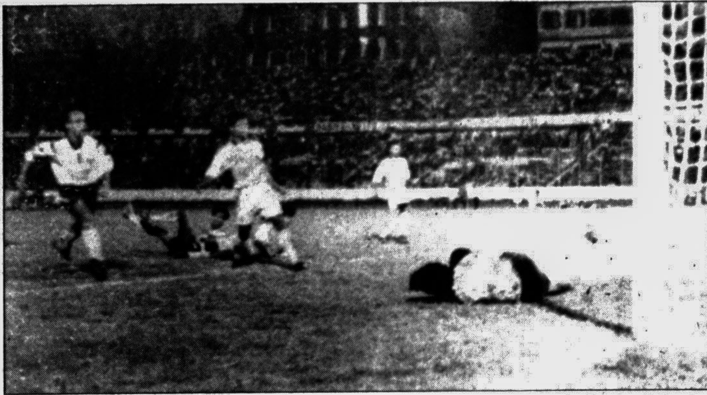
Action from yesterday's Lifebuoy Premier Division football league encounter between Mohammedan Sporting Club and Youngmen's Club Fakirpool at the Dhaka Stadium. Mohammedans won the match 1-0.