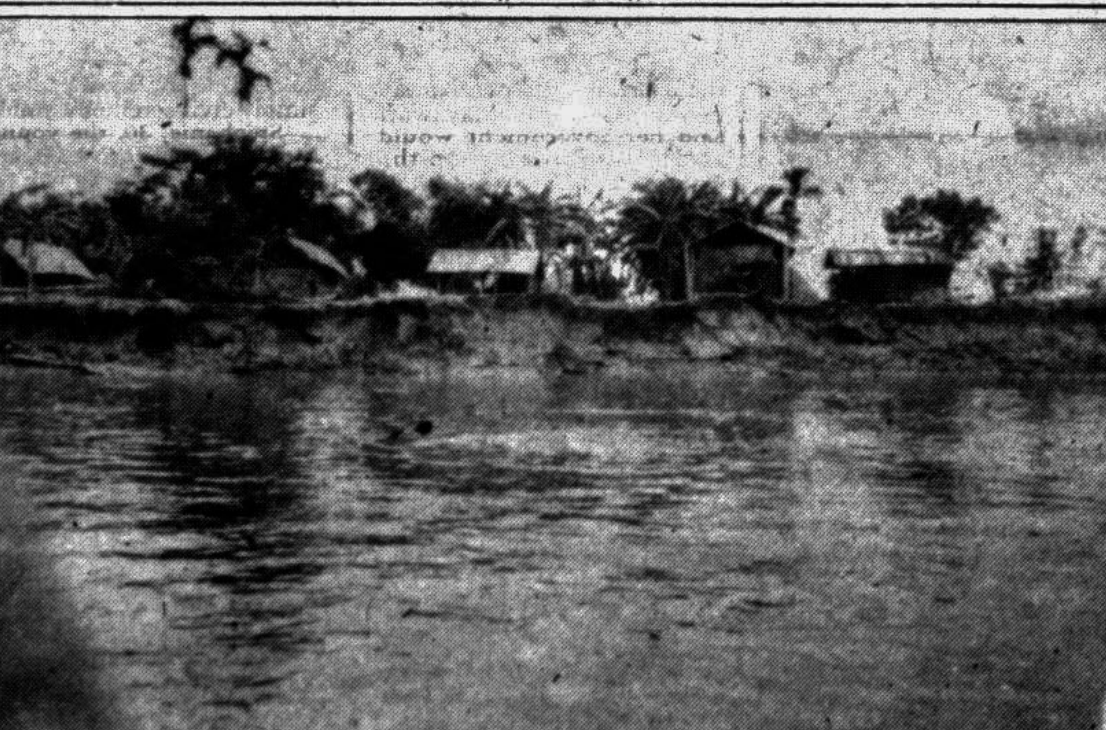
SYLHET: Four hundred dwellings in village Assampara and Chhoylakhal in Gowainghat thana have been engulfed by the river recently.