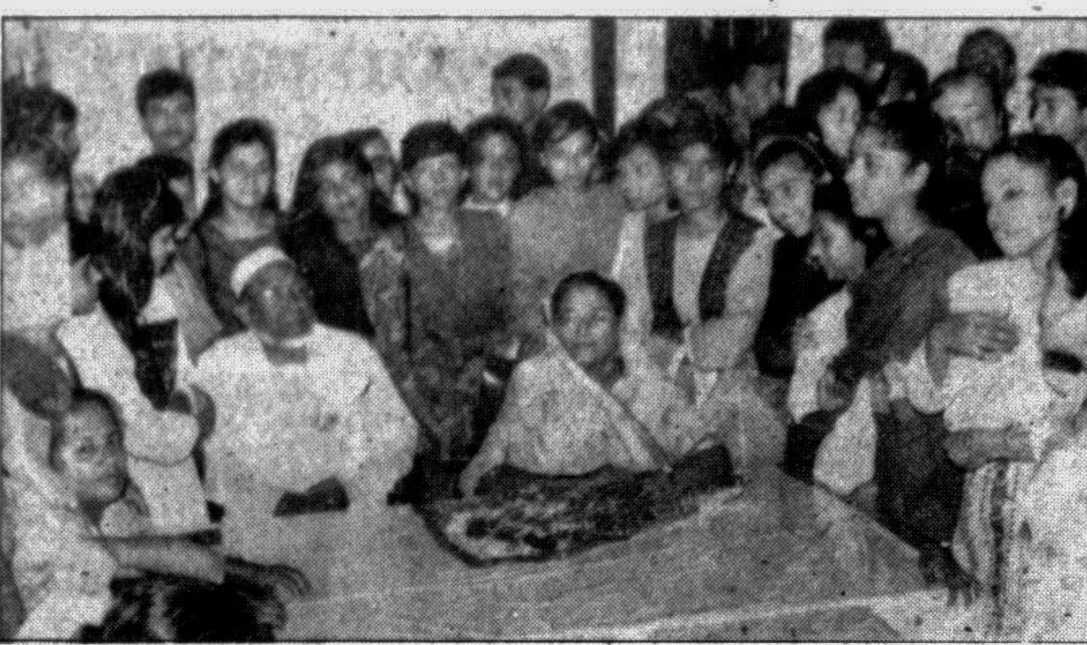
SYLHET: The newly elected office-bearers of Sylhet Govt Mohila College students union met Awami League president Sheikh Hasina in the Sylhet Circuit House on Wednesday.

PATUAHALI, July 2: Local Government Engineering Department has taken up schemes to construct Khasherhat toll shade, Bangla bazar hat toll shade and to repair the old office building of Daulatkhana thana parishad in Bhola district during the current year, reports UNB.