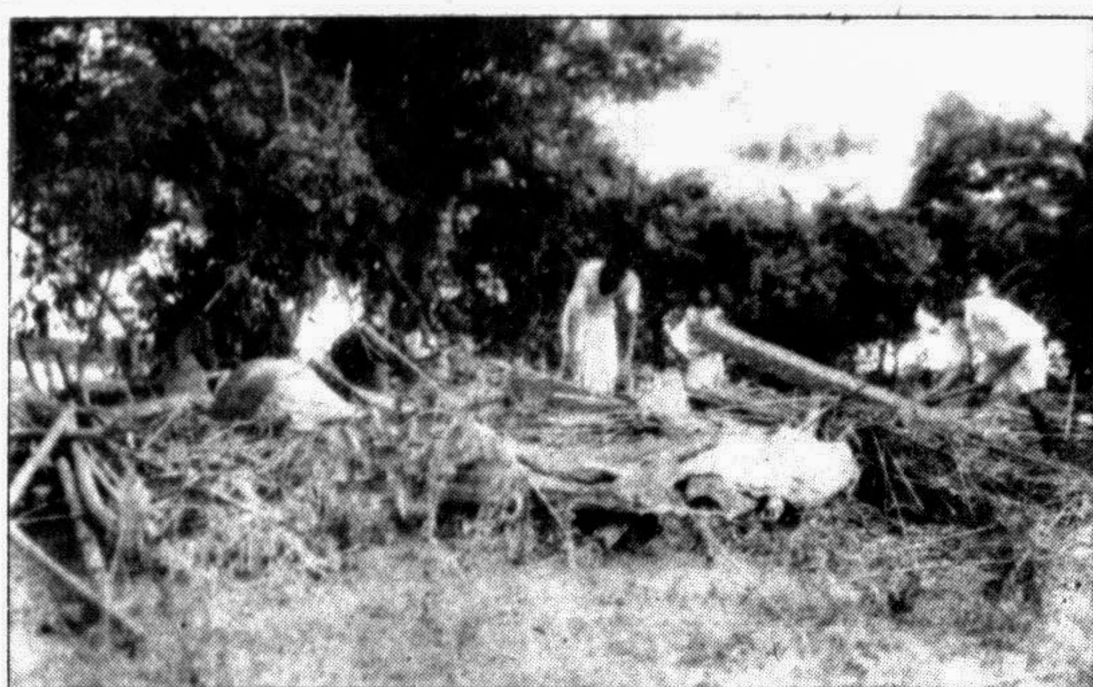
SYLHET: With the recession of flood water, most of the villagers have started to come back. Some villagers of Uttar Kholachhara under Companyganj thana rebuilding their thatched house.