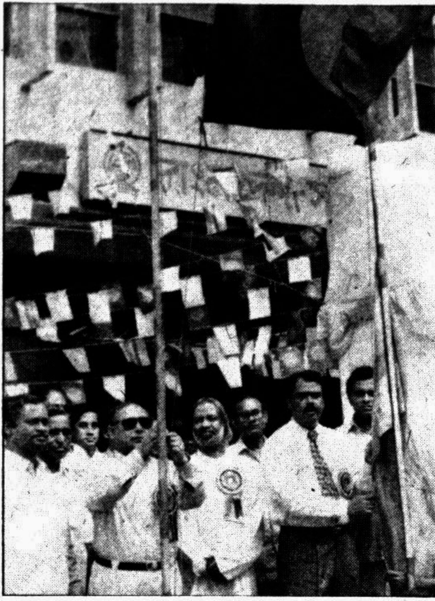
IGDR Minister Abdus Salam Talukder and president of Bangladesh Jatiya Samabay Union Salahuddin Ahmed MP hoisting the national and samabay flag in the premises of the Samabay Sadan in the city on the International Cooperatives Day yesterday. State Minister for Planning Dr. Abdul Moyeen Khan is also seen.

She was addressing a function at the Indian High Commission auditorium in the city. The function was organised by Bangladeshi students studying in India in the fields of performing arts. Indian High Commissioner Dev Mukharji and poet-architect Rabiul Hussain also addressed the function.