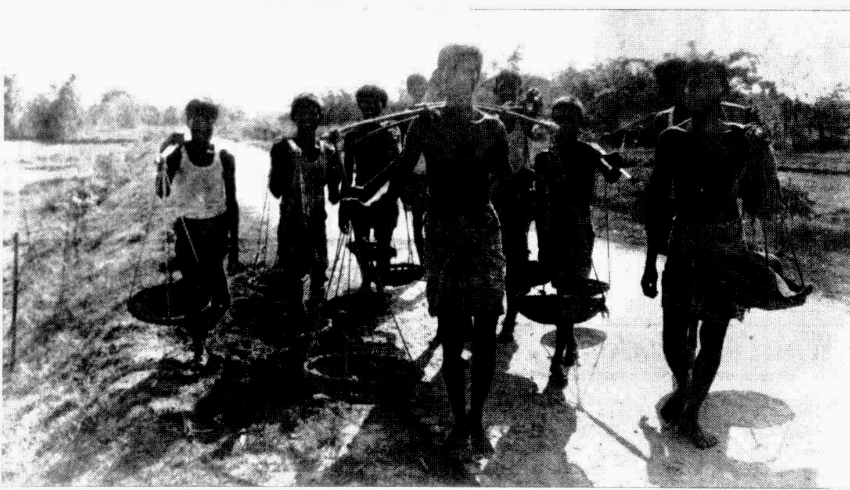
Inhabitants of Dahagram and Angorpota returning to the enclaves after their day's work.