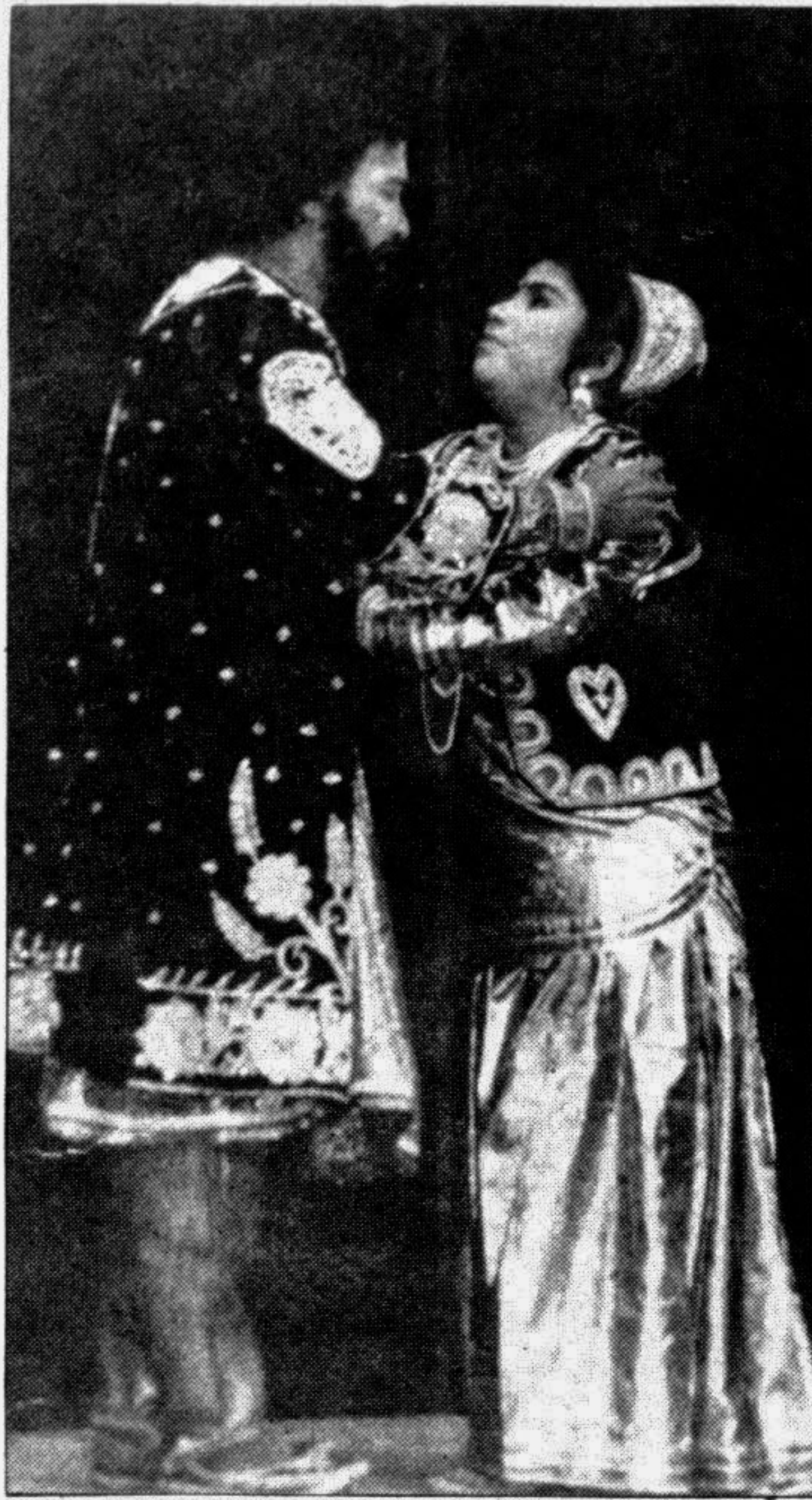
Manikganj Nabarupa Opera presenting Rupban O Rahim Badshah, a popular folklore on the opening day of a week-long folk drama festival at the Shilpakala Academy auditorium in the city yesterday.

Such cheating all around only helps increase mistrust between man and man.