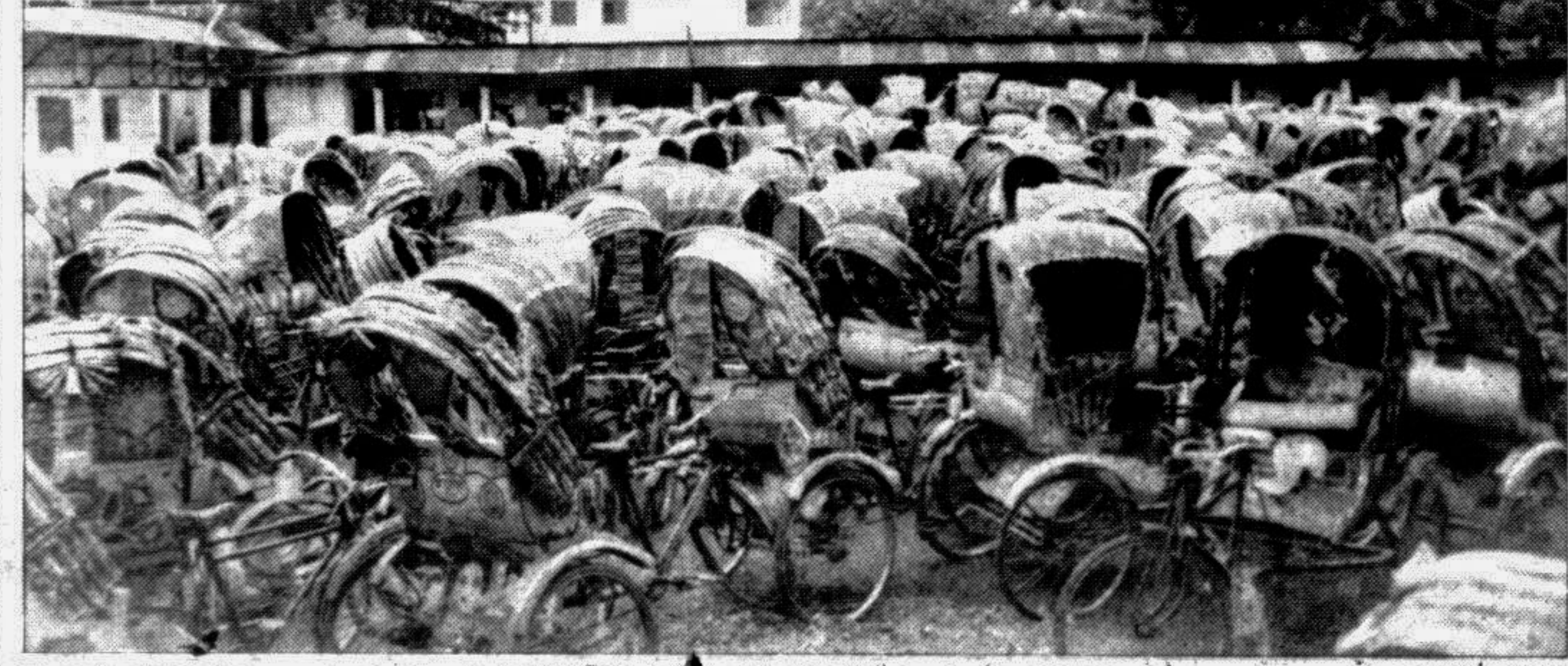
The seized rickshaws at the DCC garage at Aga Sadek Road in the city.

By Staff Correspondent A special meeting of senior BNP ministers and leaders were held at the Prime Minister's office last night to discuss the issue of absentee Opposition members' seats in Parliament, it was learnt reliably. Presided over by the Prime Minister at her Tejgaon office, the meeting was learnt to have been attended by some legal and constitutional experts. The outcome of the meeting that continued for over three hours could not be known immediately. UNB adds: Sources said the meeting discussed various options including sending the issue to the Appellate Division of the Supreme Court under the Article 106 to seek its opinion. The BNP leaders were learnt to have conveyed the experts opinion to the Prime Minister. As per Article 67 (1) (b) of