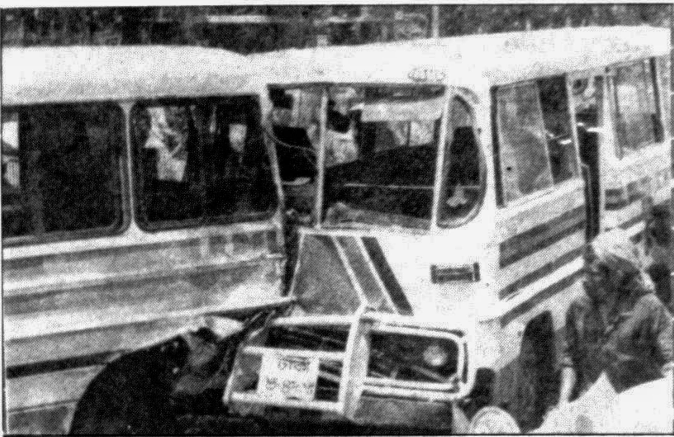
Two minibuses collided head on at Shahbagh in the city yesterday.