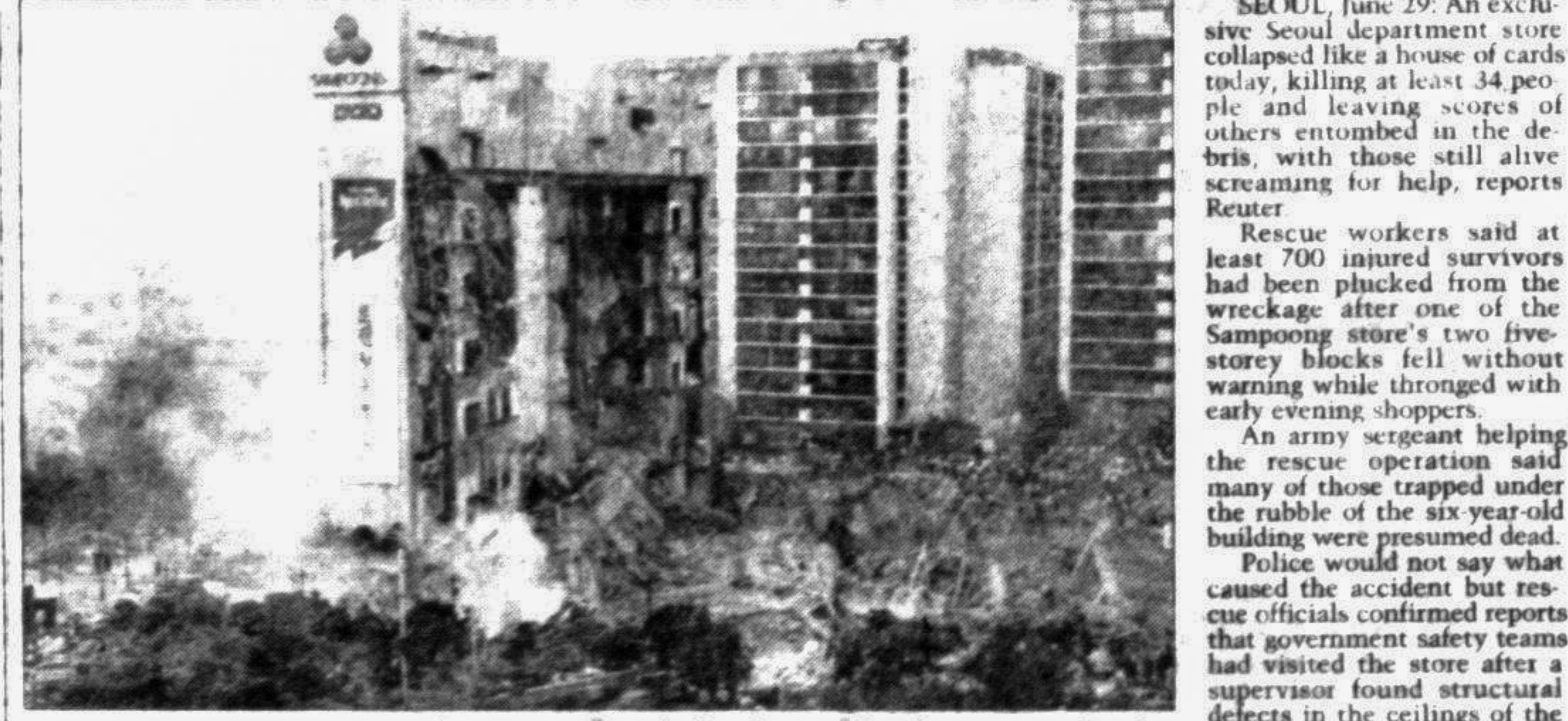
Overview of collapsed Sampoong Department Store in Seoul yesterday where scores of rush-hour shoppers and staff are trapped under debris. At least 34 bodies have been recovered.