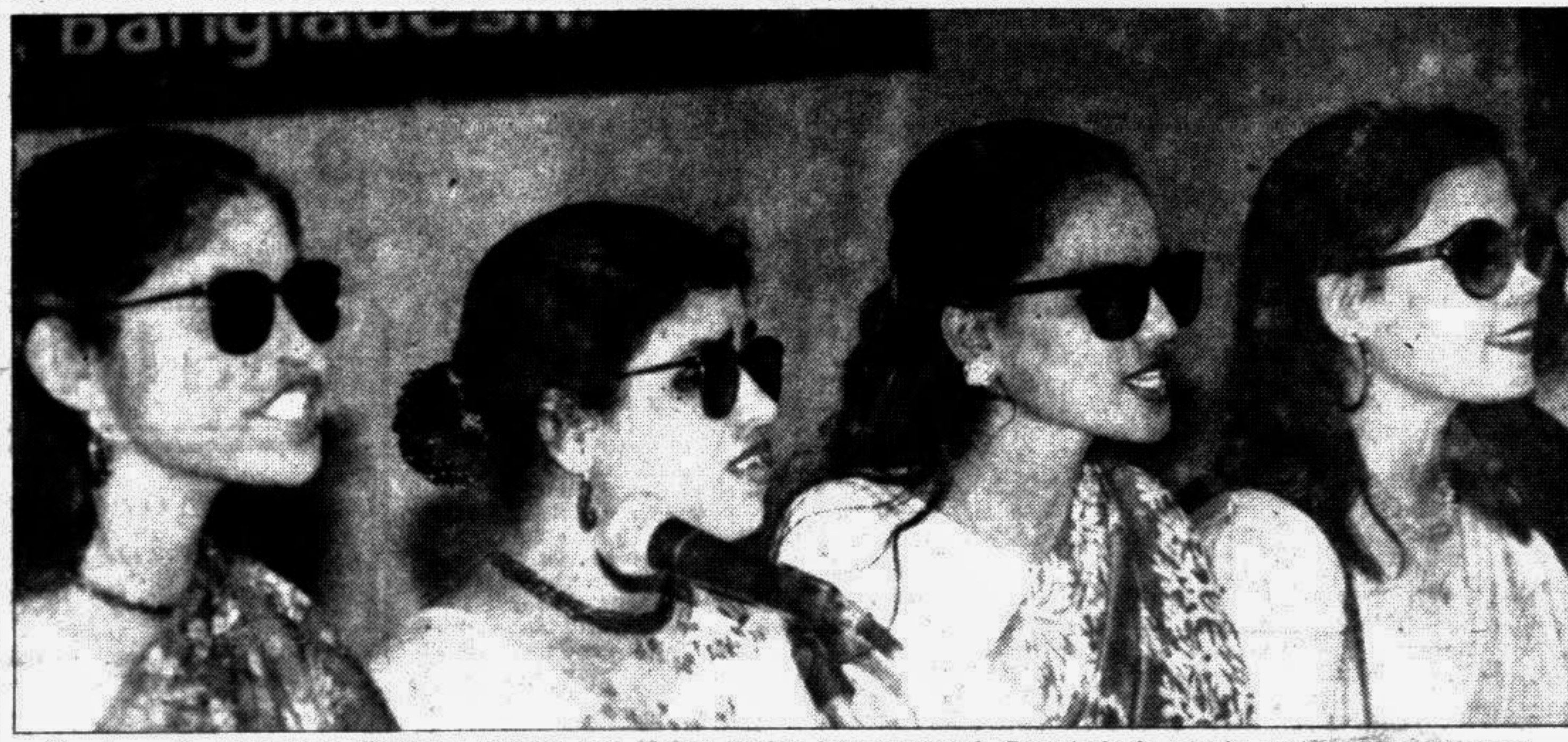
The Visually Impaired Women's Forum and Helen Keller International, Bangladesh jointly organized a cultural function at the Engineers' Institution in the City yesterday marking the 115th birth anniversary of Helen Keller.