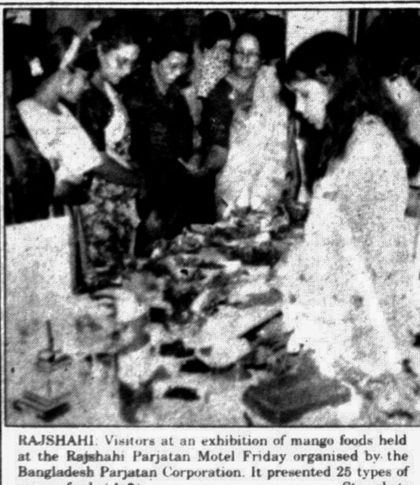
RAJSHAHI. Visitors at an exhibition of mango foods held at the Rajshahi Parjatan Motel Friday organised by the Bangladesh Parjatan Corporation. It presented 25 types of mango foods (left)