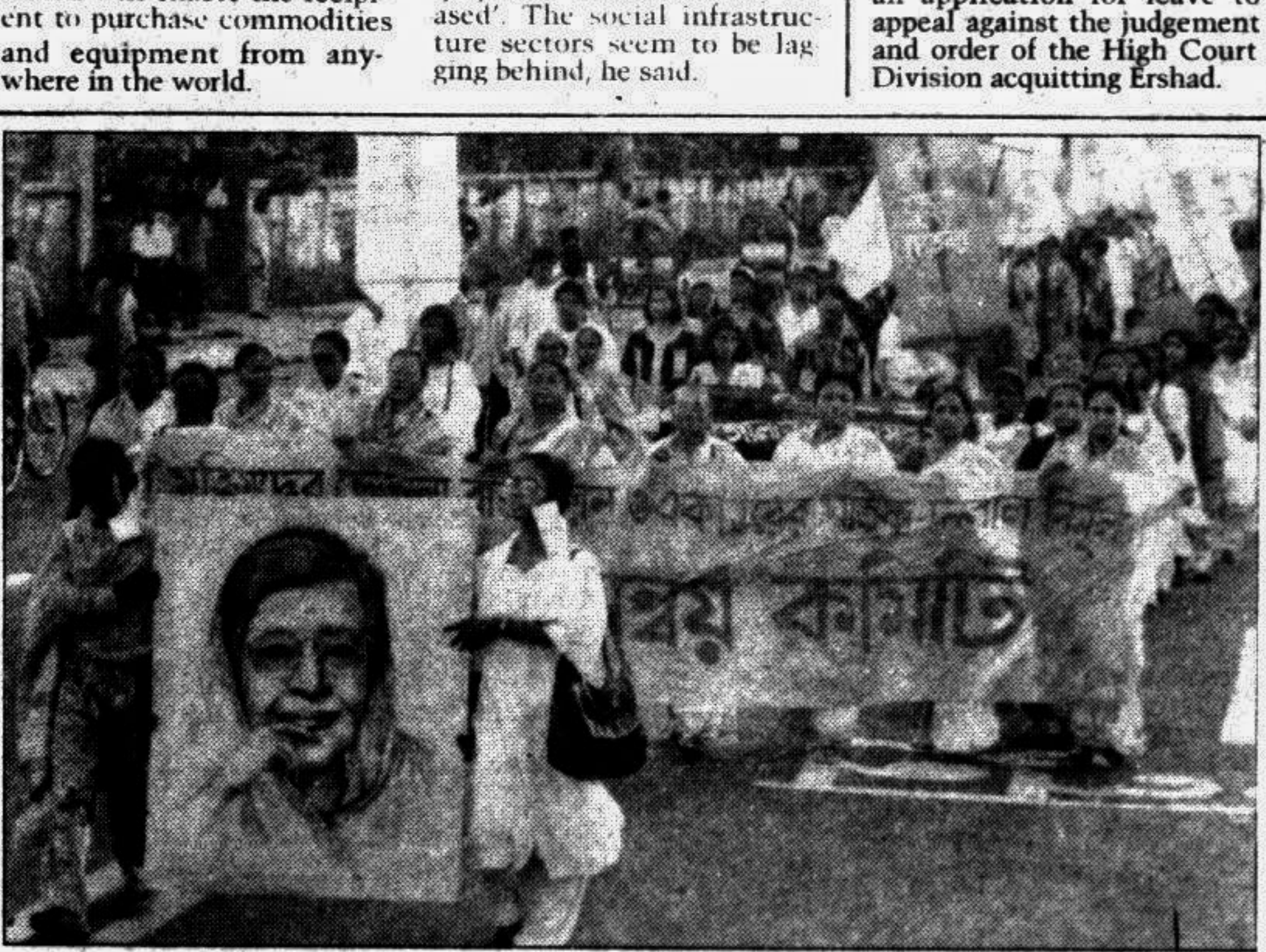
The Nirmul Committee brought out a procession in the city yesterday marking the first death anniversary of its leader Jahanara Imam.

Flood From Page 1 people were still in distress as the flood situation in four thanas of the district remained unchanged although rivers in the area receded slightly. Water Development Board source said the Ghagot, the Teesta and the Brahmaputra were still flowing above danger levels in Sadar, Fulchhari, Saghatia and Sundarganj thanas. With water sliding down the Jamuna, the flood situation in Sirajganj district showed signs of improvement yesterday. According to official sources, the Jamuna was flowing 33 cm below danger level here. But its tributaries, including Ichhamati, Karatoa and Chumani, remained static. Civil Surgeon office said at least 1,000 people were attacked by diarrhoea. Several medical teams have been working to tackle the situation. JP hartal From Page 1 demand for Ershad's release, said party sources. Political observers apprehend violence during today's hartal as, they said, the government might be tough on the pro-hartal activists. According to insiders, the JP will intensify the release-Ershad campaign side by side agitating for a caretaker government to conduct the next general elections. Meanwhile, the JP organised rallies and processions in different city areas to drum up support for today's hartal. The JP acting chief Mizanur Rahman Choudhury and secretary general Anwar Hossain Manju, in a statement last night, called upon the city people to observe the hartal. They also condemned police action against party workers in the last few days.