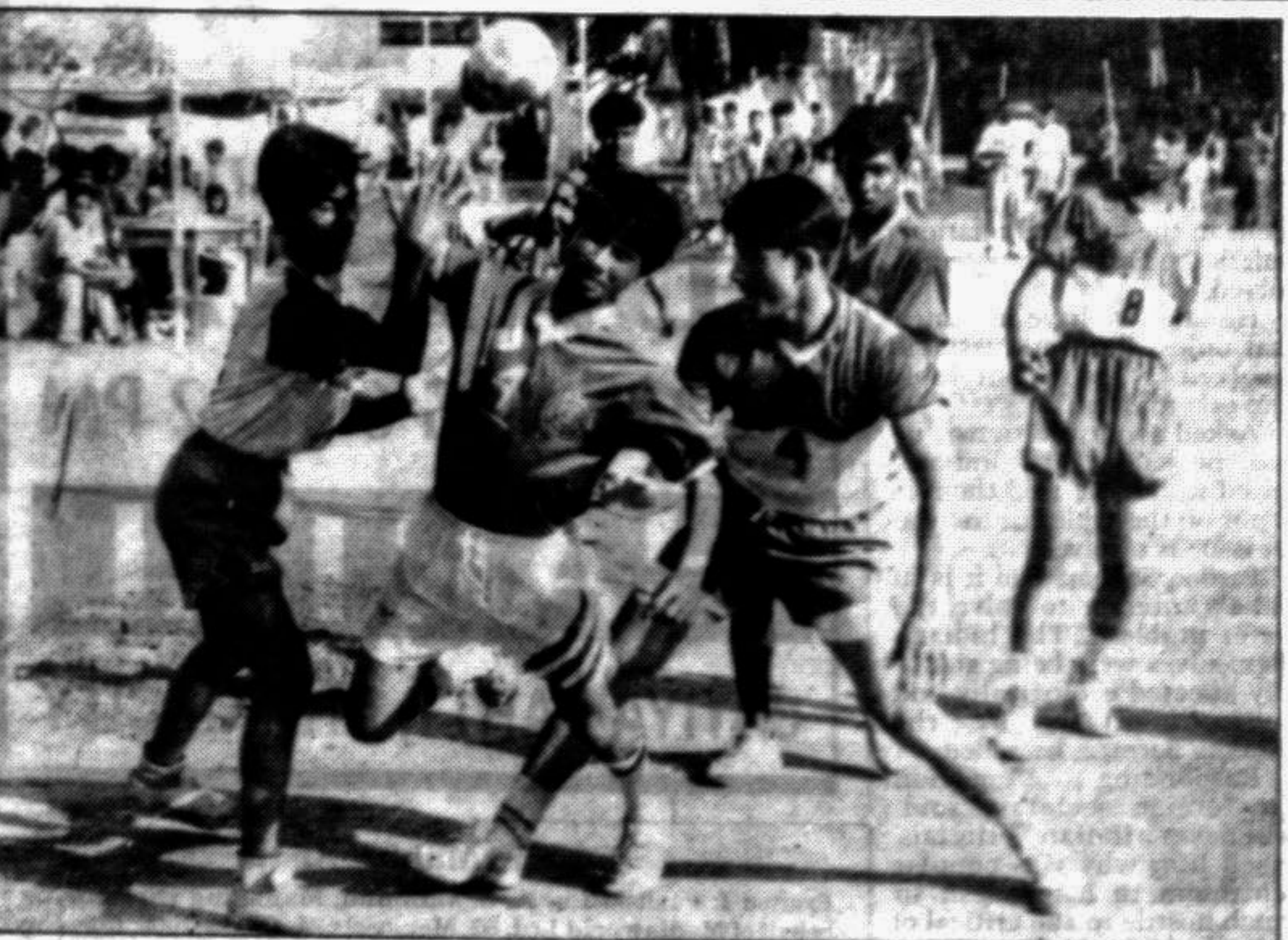
Action from yesterday's sixth Bata schools handball match between Ansar VDP High and West End High at the handball court adjacent to the Dhaka Stadium. Ansars beat West End by 20-9 goals.

Mayweather formerly held the World Boxing Association super featherweight and World Boxing Council light welterweight titles and was also the light welterweight and welterweight champions of the International Boxing Organization.