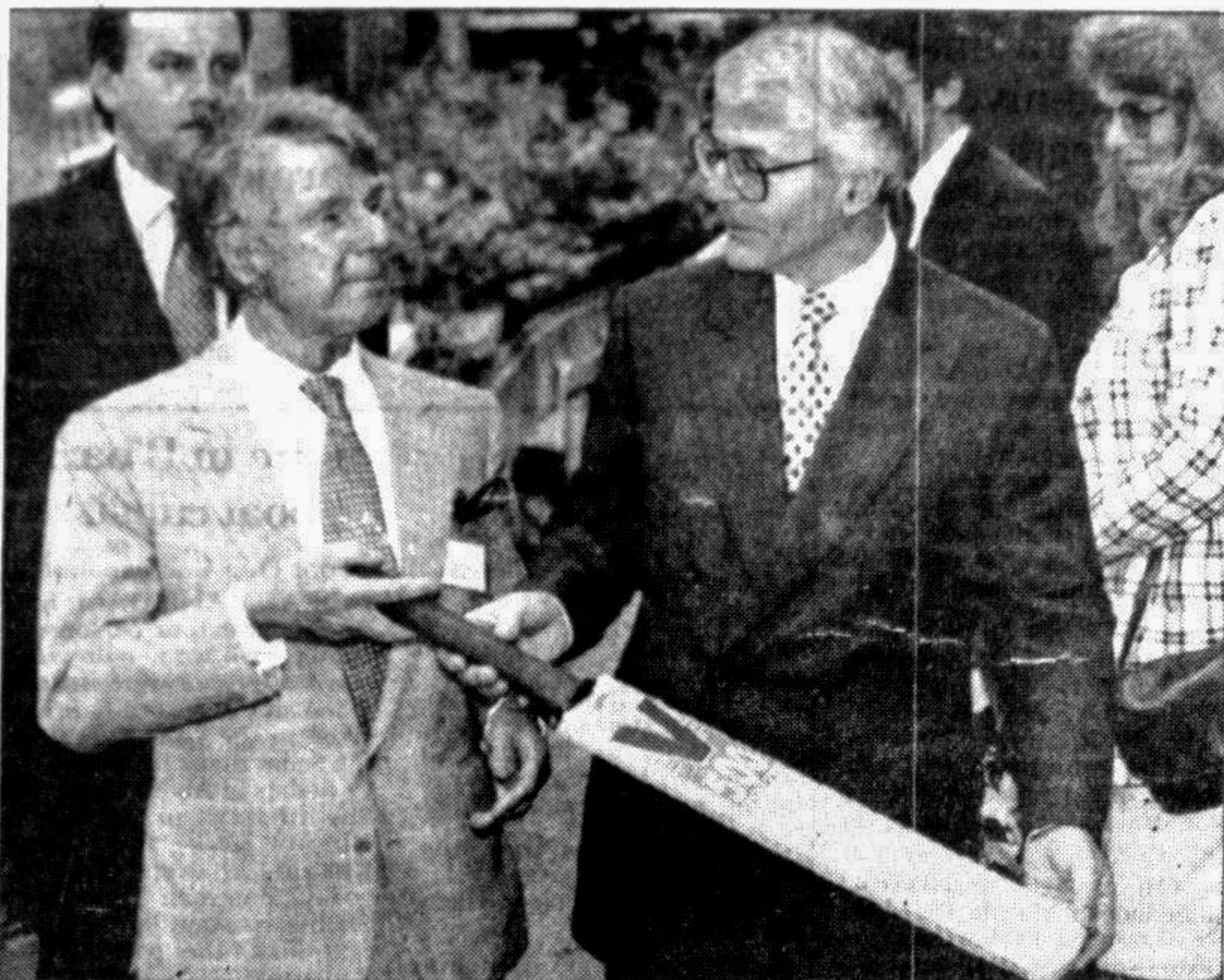
British Prime Minister John Major (R) receives a cricket bat as being presented by Sir Basil Feldman, chairman of the National Union at Tory Party headquarters in London on Saturday.