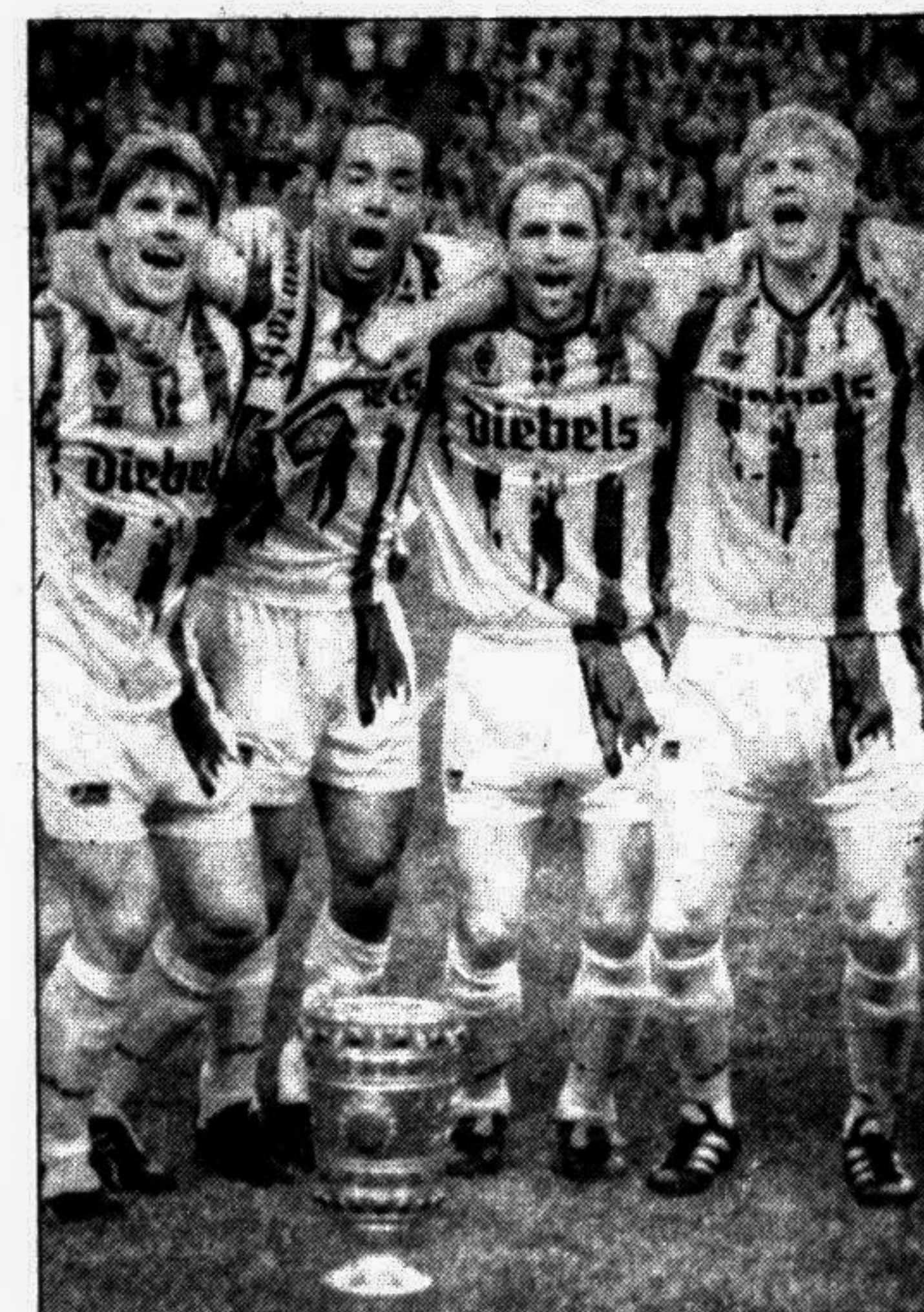
Borussia Moenchengladbach players (from l-r) Michael Klinkert, Martin Dahlin, Christian Hochstaetter and Stefan Effenberg open up their voices for a song after beating VFL Wolfsburg by 3-0 in the final of German Soccer Federation Cup in Berlin on Saturday.

His club has already invested heavily for next season with the signings of World Cup striker Jurgen Klinsmann from Tottenham and Austrian midfielder Andreas Herzog from Werder Bremen.