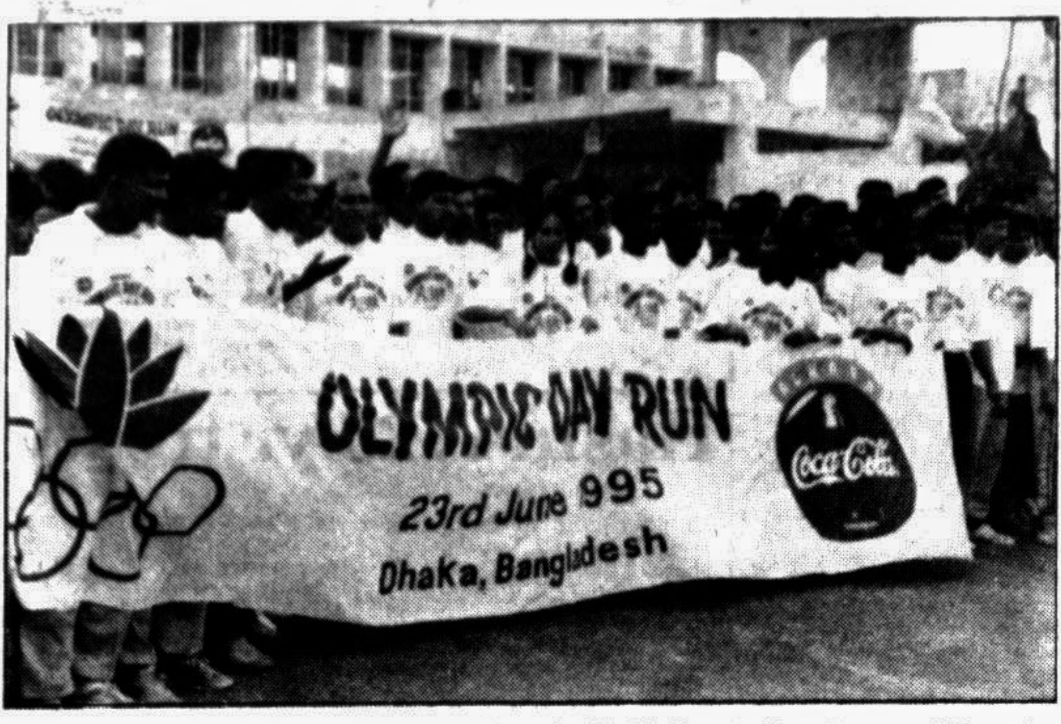
Participants of the Olympic Day Run marking the World Olympic Day '95 start off from the Army Stadium, yesterday.