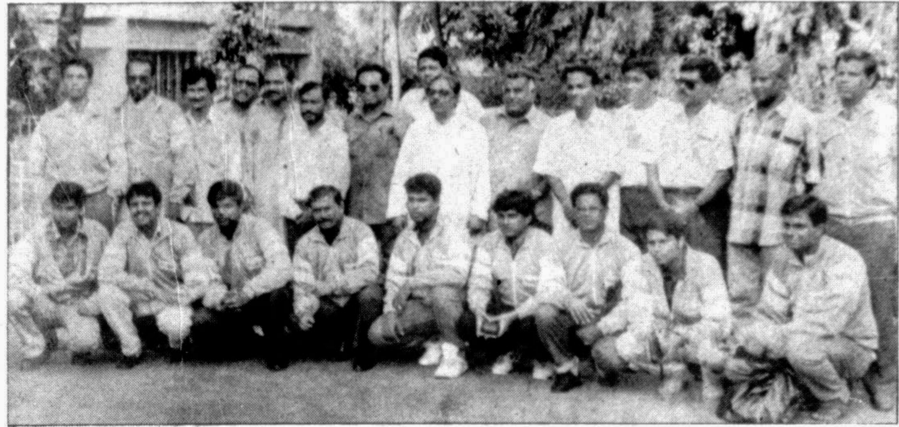
Players and officials of the Jatiya Press Club team which left Dhaka yesterday to take part in the SAARC media cricket tournament in the Indian city of Hyderabad.

Press Club media cricket squad off to Hyderabad A 16-member Jatiya Press Club cricket squad left Dhaka yesterday for the Indian city of Hyderabad to represent Bangladesh in the first ever SAARC media cricket tournament, reports UNB.