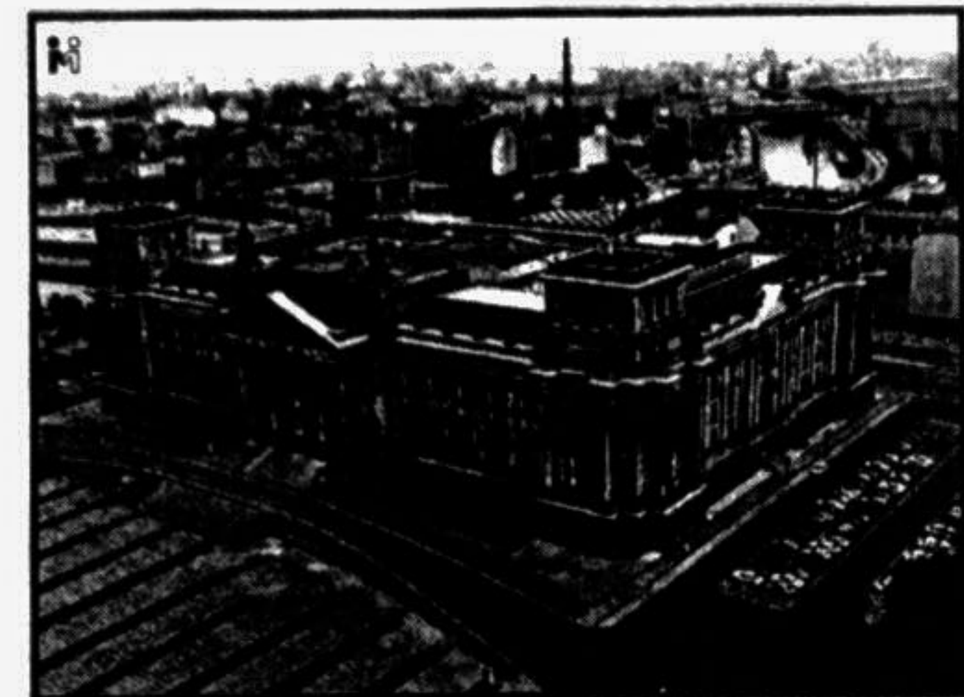
Aerial view of the Reichstag

After 23 years' campaigning, the husband-and-wife team known as Christo Javacheff have got permission to wrap Germany's best-known building. Yes — wrap it, in metallic fibre. Gemini News Service reports on an extraordinary work of art which has been designed not to last. (Unveiling of the veiled Reichstag building, 23 June)