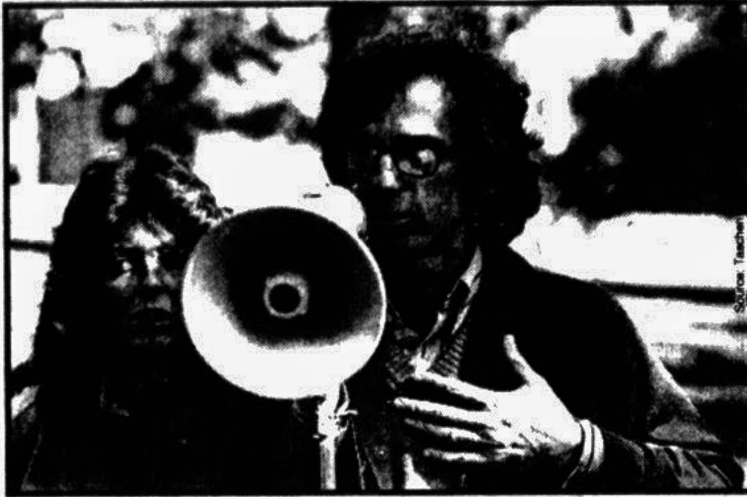
Jeanne-Claude and Christo

He has wrapped a bridge in Paris, a dockside in Cologne and a museum in Chicago and now Christo Javacheff expects four million people to see his biggest piece of packaging yet — Germany's former Parliament building. It has taken 24 years to secure the go-ahead for the wrapping of the Reichstag in thousands of square metres of metallic fabric. The Bulgarian-born artist and his French wife Jeanne-Claude who choose to be known as one person for the 10 million deutschmark project — have had to overcome the opposition of Chancellor Helmut Kohl and a parliamentary debate. Critics dismiss the project as a display of the artists' personal vanity and say it has no meaning. Detractors also argue that it will glorify a building that represents dark aspects of German history: its destruction by fire in 1933 was used by fascist party leader Adolf Hitler to justify a clampdown on the opposition. Christo, however, describes it "as a symbol of the meeting of East and West and the restoration of hope for the