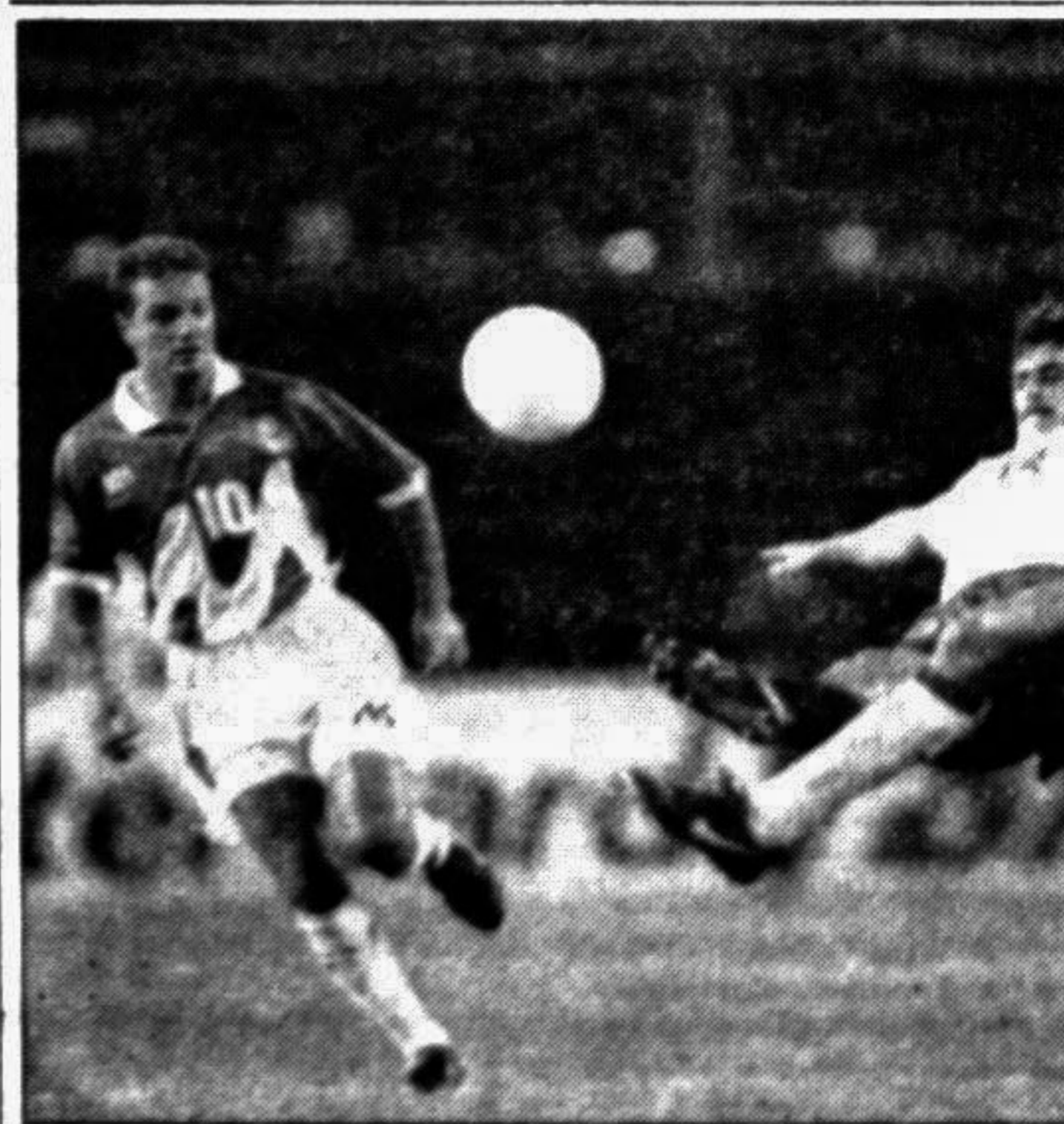
A midfield duel during the match between Colombia and Mexico in US Cup '95 tournament in Washington on June 21. The game ended goalless.

HALLE, Germany, June 22: Organisers of the Halle Open tennis tournament, who have spent millions of marks modelling their new stadium and surface on Wimbledon, have come under fierce criticism from home German star Michael Stich, reports Reuter.