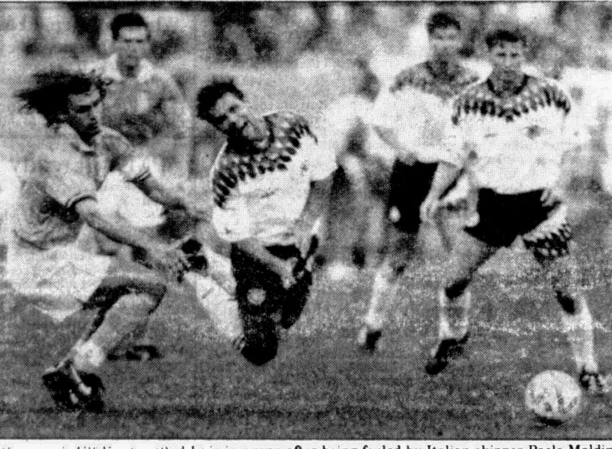
Germany's Ulf Kirsten (2nd L) is in agony after being fouled by Italian skipper Paolo Maldini while Kirsten's two teammates (background) look on during their match in a three-nation tournament in Zurich on June 21. Germany won 2-0.

"It is obvious he is looking forward to the new season, to a new start and to performing well," he added.