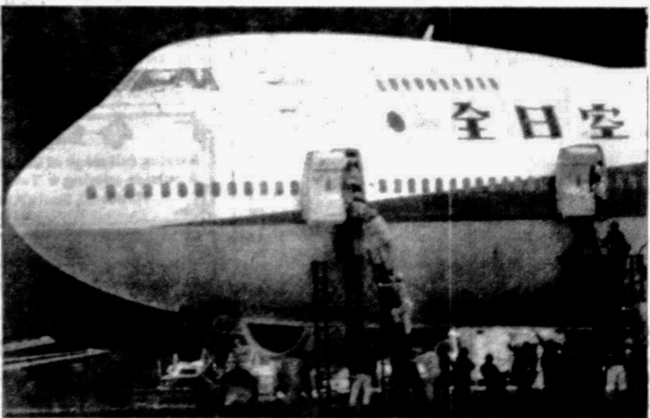
Japanese security officers in Hakodate storm the All Nippon Airways plane hijacked by a suspected Aum Supreme Truth doomsday cult member in a pre-dawn operation yesterday. All passengers and crew were freed.

WASHINGTON, June 22: The chairman of the House immigration subcommittee announced legislation Wednesday to cut legal immigration by 30 per cent and crack down on illegal entrants by fortifying the southern borders with increased patrols and "impenetrable" fences, reports AP. It was the opening shot of what promises to be a contentious debate on responding to public anxiety over illegal immigration and overhauling the nation's 30-year-old system for prioritising legal immigrants. "What's in the best interests of the American worker and the American economy is what drives us," said chairman Lamar Smith, a Texas Republican, in announcing the bill, which is expected to be formally introduced with 11 co-sponsors today. The legislation would set and annual ceiling of 330,000 family-sponsored immigrants and eliminate visa eligibility for the brothers, sisters and adult children of citizens. It would also cap employment-based immigration at 135,000 and refugees and asylum-seekers would be limited to 70,000. Those numbers are down from an total of about 830,000 legal entrants under current law. Smith's bill would increase the number of border patrol agents by 5,000 over 10 years and increase by 500 the number of federal agents enforcing laws against the hiring of illegal immigrants. See Page 8 Col 8