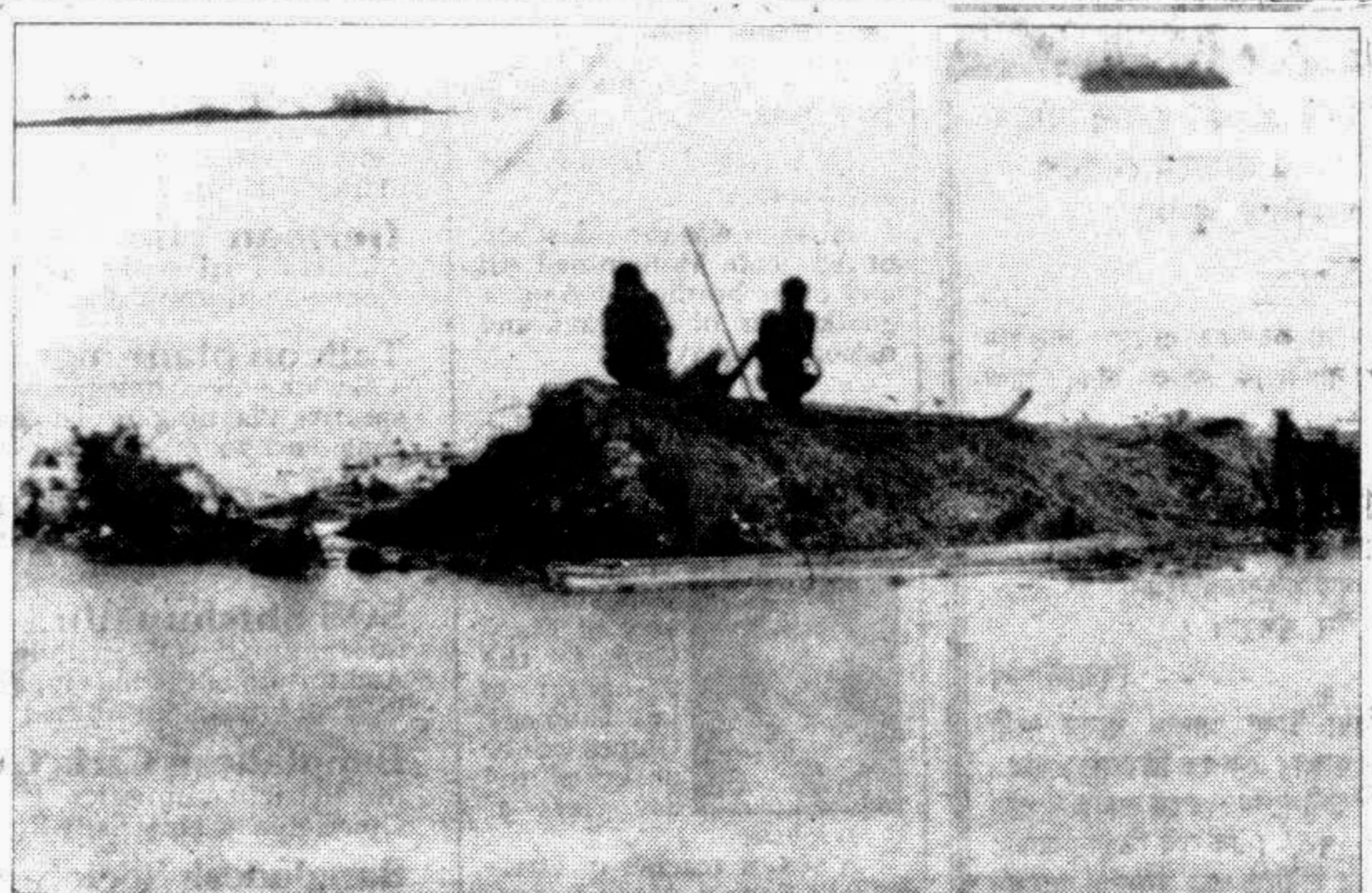
Two brothers sit marooned on the roof of their thatched house after flash floods inundated village Nijpat under Jaintapur thana of Sylhet district.