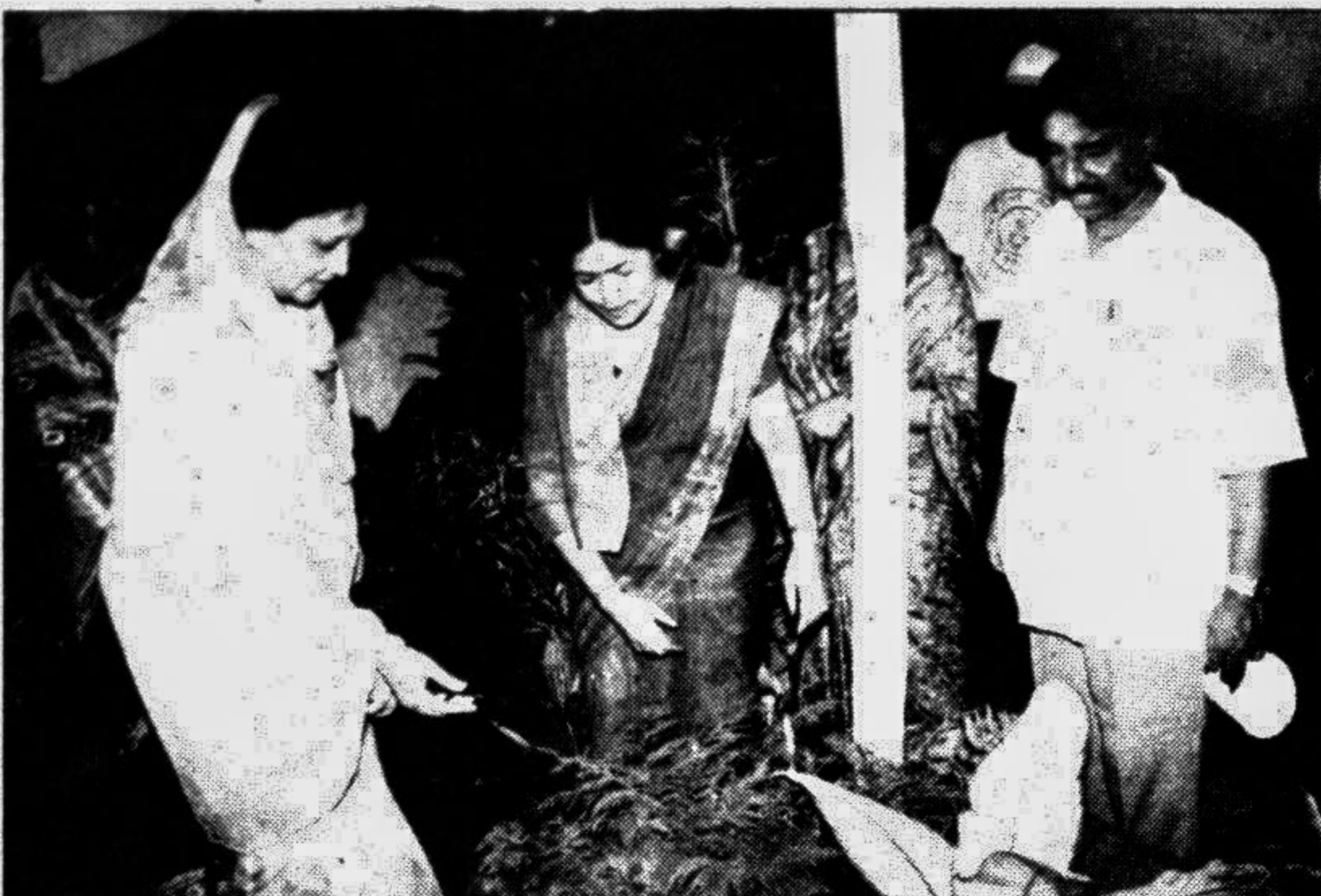
Prime Minister Begum Khaleda Zia went round different stalls after inaugurating the week-long Tree Fair organised as part of Tree Plantation Campaign '95 in the city yesterday. (story on Page one)

The shop in question, no doubt, is a unique store offering a wide variety of quality handicrafts, clothes and household ware. The convenience of having so many types of things in one place is definitely what attracts customers. The store's soaring sales and new outlets abroad show that it is certainly doing well. But the 'we are doing you a favour' attitude of the sales girls and cash counter people hardly makes good business sense. Perhaps the management should consider giving its staff some basic customer service training such as how to say thank you when giving the customer the receipt or smiling a little once in a while instead of the usual stand-offishness and unwelcoming scowls. Otherwise customers will leave the store with only one thing. A bad aftertaste.