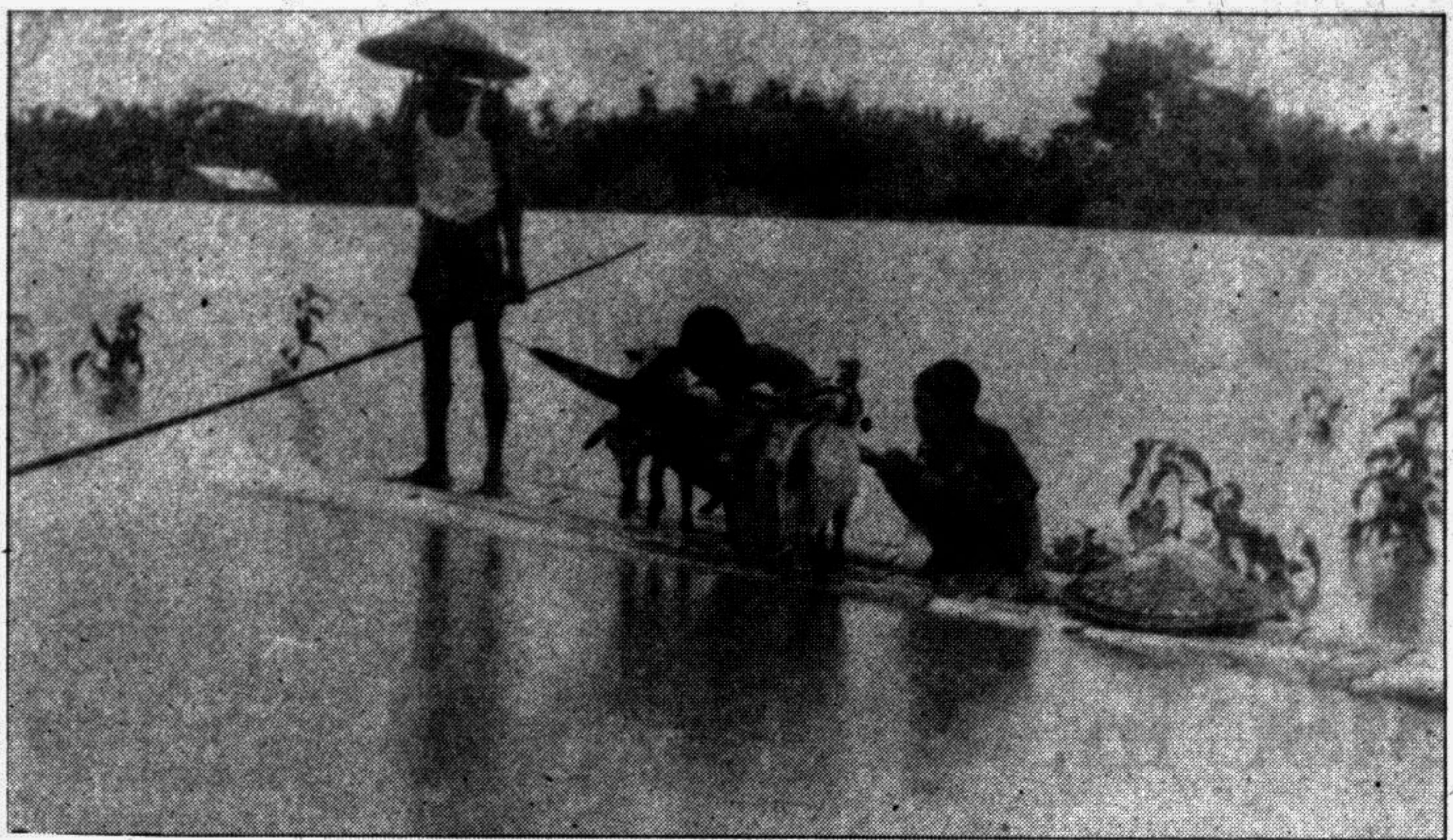
SYLHET: A man pulls his raft to a safer place from the flood ravaged Companyganj thana.

Kanaighat and Companyganj were now under 4 to 5 feet water, according to reports received here on Saturday. Flood waters have entered all the government offices and business establishments in these thanas.