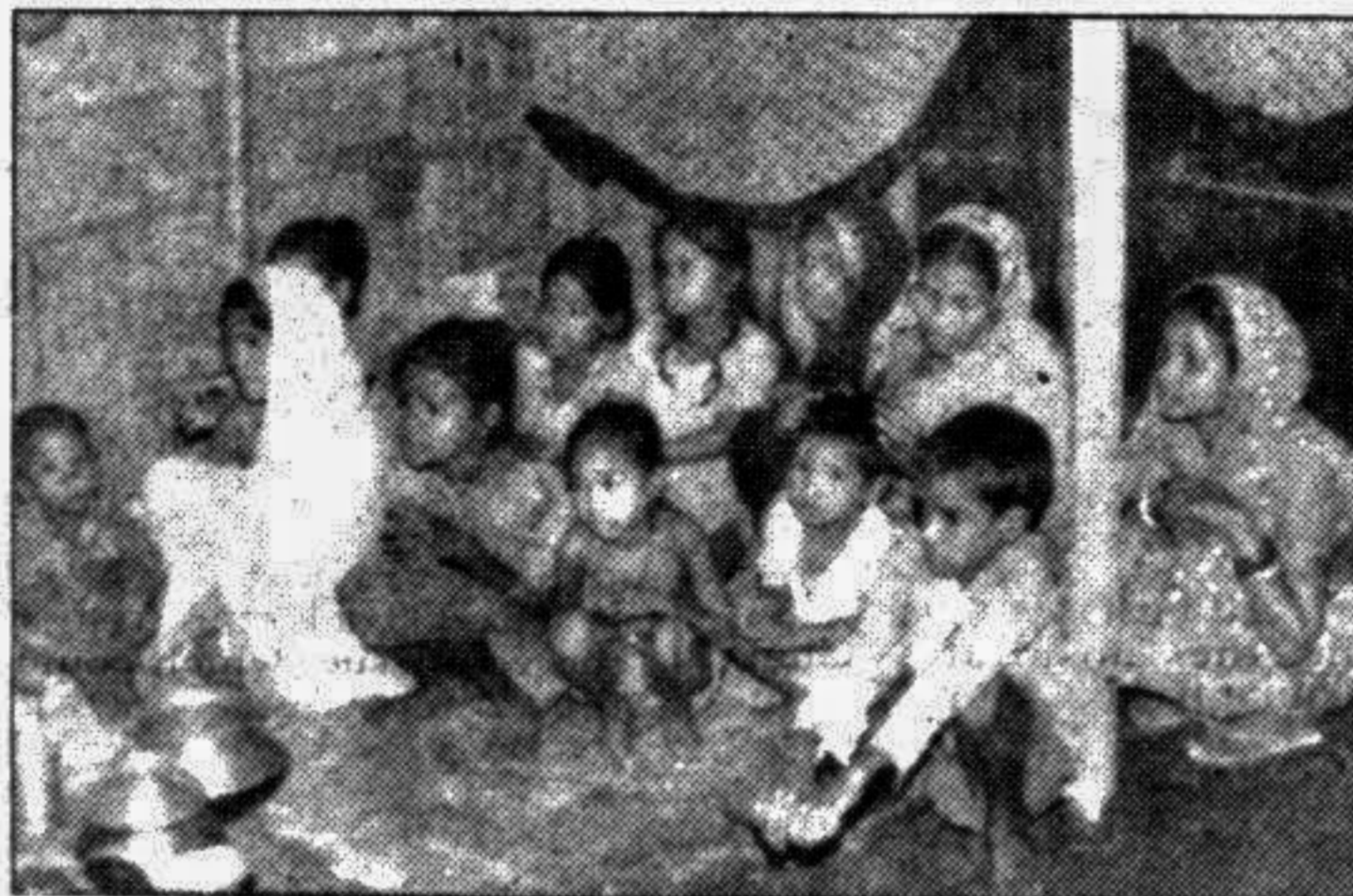
SYLHET: Some flood affected families of Chalibandar area of sadar thana took shelter in a shop on Sunday.

In Sylhet, 193 mm rainfall was recorded during the 24 hours on Saturday while it was 165 mm of rainfall recorded in Sunamganj town. The thana headquarters of Gowainghat, Jaintapur,