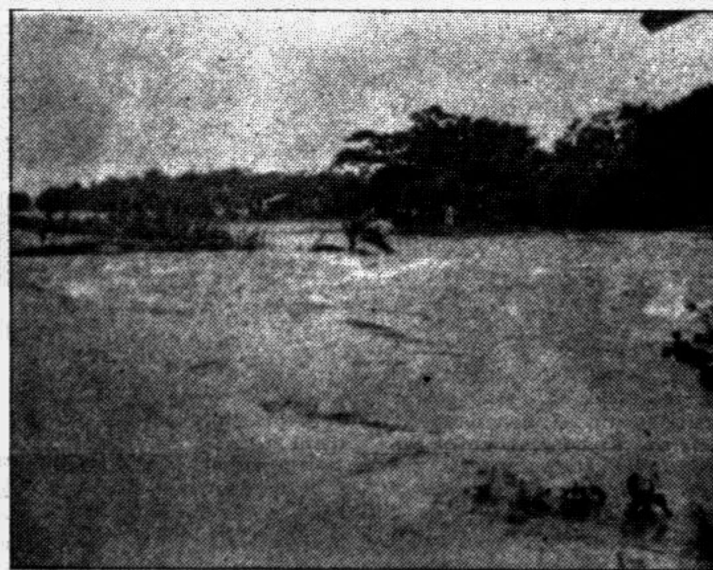
SYLHET: Flood waters marooned the newly constructed Kampasha-Biswanath-Lamakazi road on Sunday.

Thousands of flood-hit people have taken shelter in the two-storied buildings at the thana headquarters of Companyganj. Villagers of Takerbazar, Mollargaon, Jalalabad, Matkhela and Khadimnagar unions under Sylhet sadar thana have also