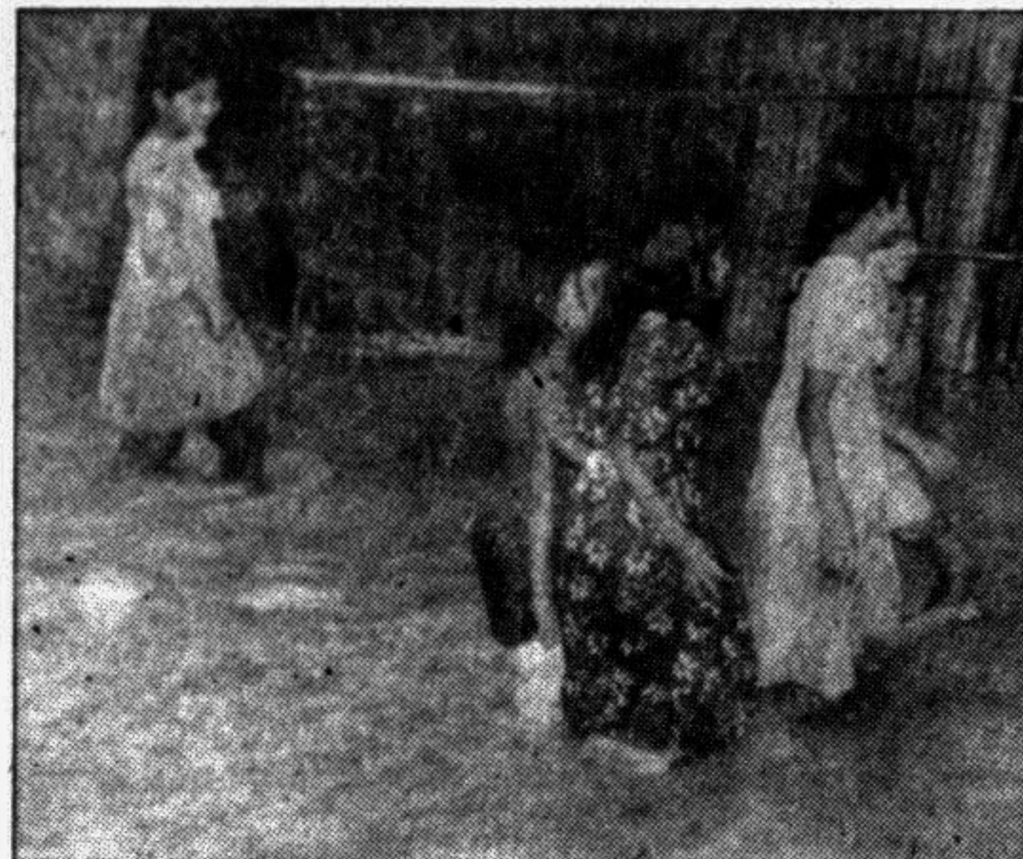
SYLHET: Young girls walk past a dwelling house at Sobhanighat area of Sylhet town engulfed by recent flood waters.

The road communication between Sunamganj and Sylhet as well as with rest of the country have been snapped from Friday afternoon. Besides, the district headquarters of both Sylhet and Sunamganj have also been disconnected as flood waters have marooned different