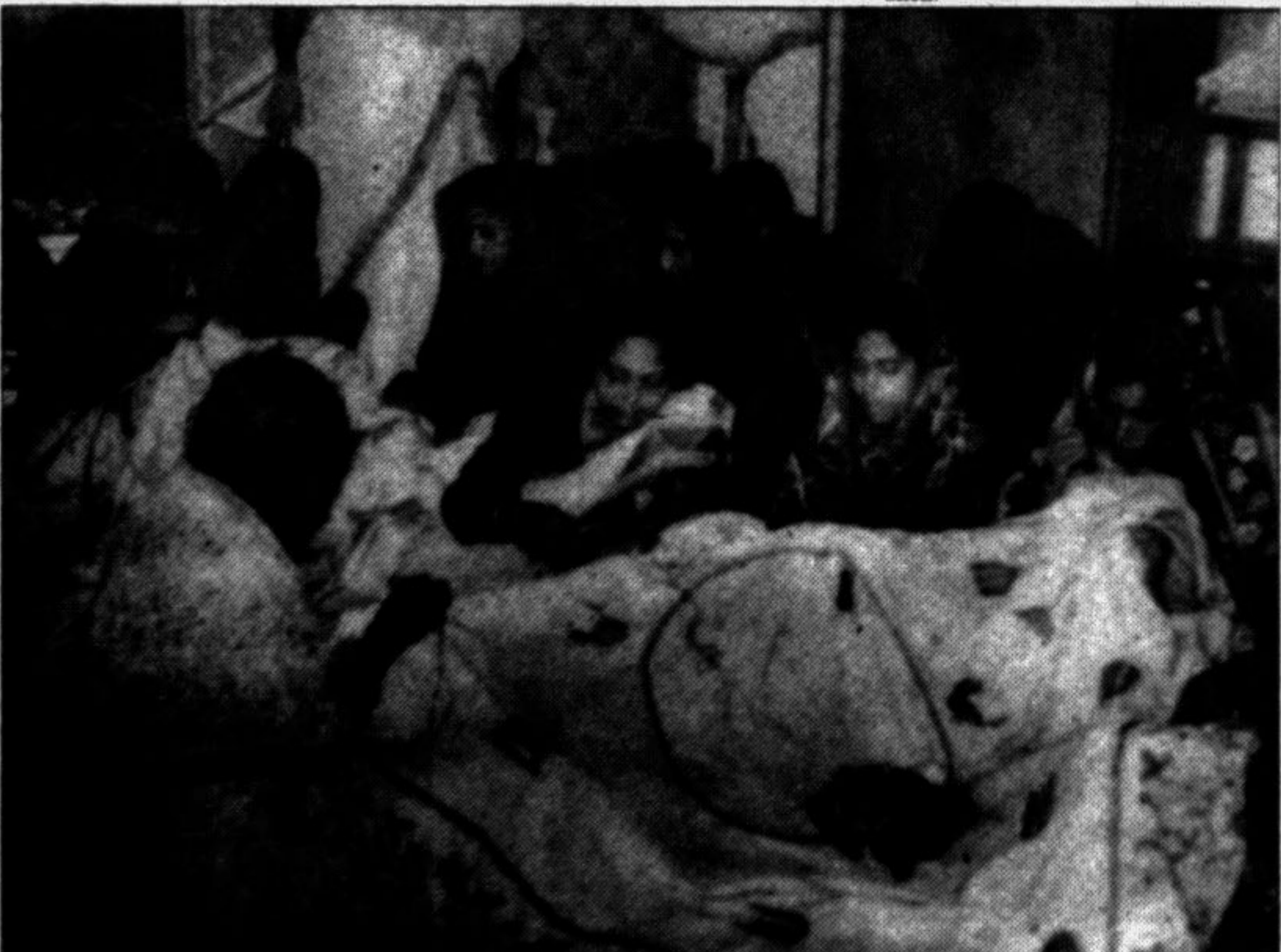
JHENIDAH: Some women members are taking training on stitching nakshi kantha at WEDP office in Jhenidah.