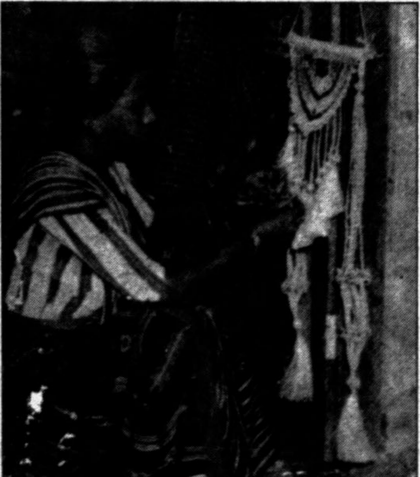
JHENIDAH: A woman weaving a rope-shelf in a project arranged by WEDP at Jhenidah.

The Officer-in-Charge informed that they had distributed Taka 47 lakh 36 thousand among 1564 loanees in 103 villages out of 290 villages of sadar thana of the district. They are going to introduce a new project on weaving industry, it was added. About the next programme of WEDP, Officer-in-Charge informed that they will form groups of 10 or more members and WEDP will invest money among loanees directly and more people would be benefited with the new programme as WEDP is a hundred per cent successful programme of BSCIC, sources said.