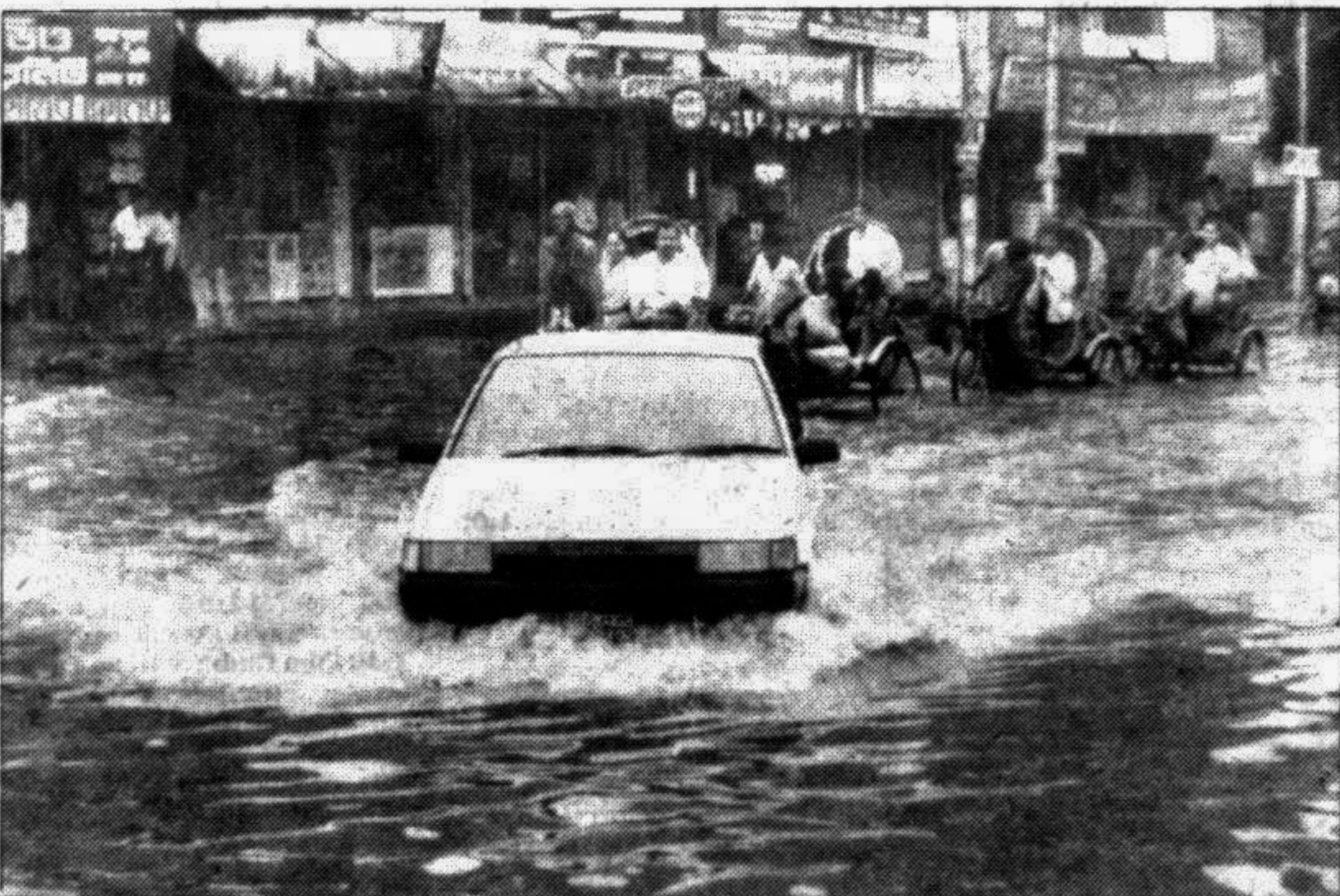
Roads in Shantinagar area of the city went under knee-deep water due to heavy rainfall yesterday.

By Staff Correspondent Continued rise in water levels of the country's major rivers, caused by heavy downpour, flooded fresh areas in Manikganj, Sylhet, Moulvibazar, Sirajganj and Pabna districts, according to reports received in Dhaka last night. The flood situation in Sunamganj, Netrakona and Jamalpur districts deteriorated further. Meanwhile, the capital witnessed a heavy downpour for almost the whole day yesterday. City life was paralysed and there was thin traffic on the roads. Low lying areas were inundated. The sudden rise in water levels of the Padma and the Jamuna during the 24 hours till yesterday morning, submerged vast areas of Manikganj district and disrupted ferry links between the country's northern and eastern regions. At least 860 families were rendered homeless due to erosion of the Jamuna in Shibabaya, Harirampur and Daulatpur thanas. Ferry services in Aricha-Nagarbari and Aricha-Daulatdia routes were seriously affected as the BIWTA closed one of its two pontoons at Nagarbari ghat and another at Daulatdia. A report from Sylhet said flood waters submerged the runway of the Osmani Airport yesterday. A scheduled flight was, however, operated in the afternoon. Flash floods also submerged five thanas of the