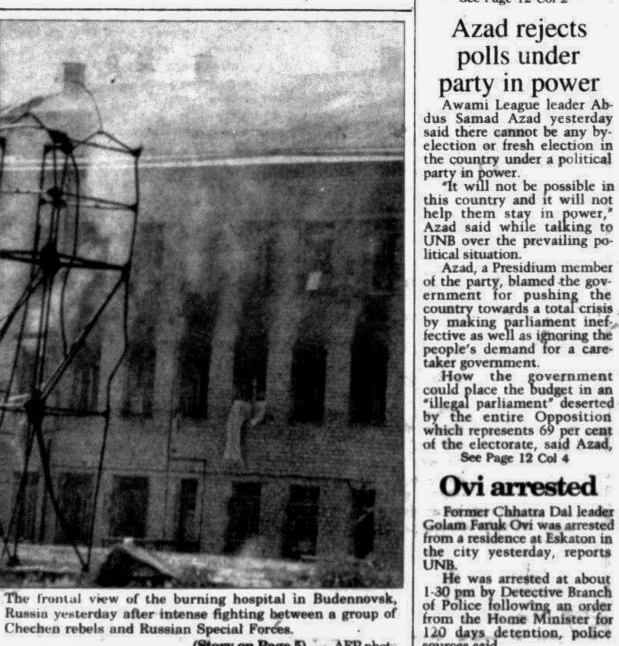
The frontal view of the burning hospital in Budennovsk, Russia yesterday after intense fighting between a group of Chechen rebels and Russian Special Forces. (Story on Page 5).

Star Report The government has fixed a target of building a security stock of 11 lakh tonnes of foodgrains for fiscal 1995-96 to meet any possible shortage of supply in the market. "Our plan is to maintain this stock and we have already arranged more than eight lakh tonnes," an authoritative source in the Food Ministry said yesterday. Elaborating, the source said about seven lakh tonnes have reached government godowns while over one lakh tonnes are being unloaded at the Chittagong and Mongla ports. The government plans to build the security stock through imports and internal procurement. Under the ongoing IRRI-Boro procurement drive, the government has a target of buying three lakh tonnes of rice for the security stock. But it is unlikely to be achieved due to poor response from the farmers, one source pointed out. Official sources said that the Food Department has so far procured about 70,000 tonnes of rice and 20,000 tonnes of paddy since the beginning of the drive last month. "Farmers are reluctant to sell their rice and paddy to the Food Department since they are getting higher prices in the market, the sources said. The procurement price of IRRI-Boro for the current season is Taka 11.25 per kg for rice and Taka 7.15 per kg for paddy.