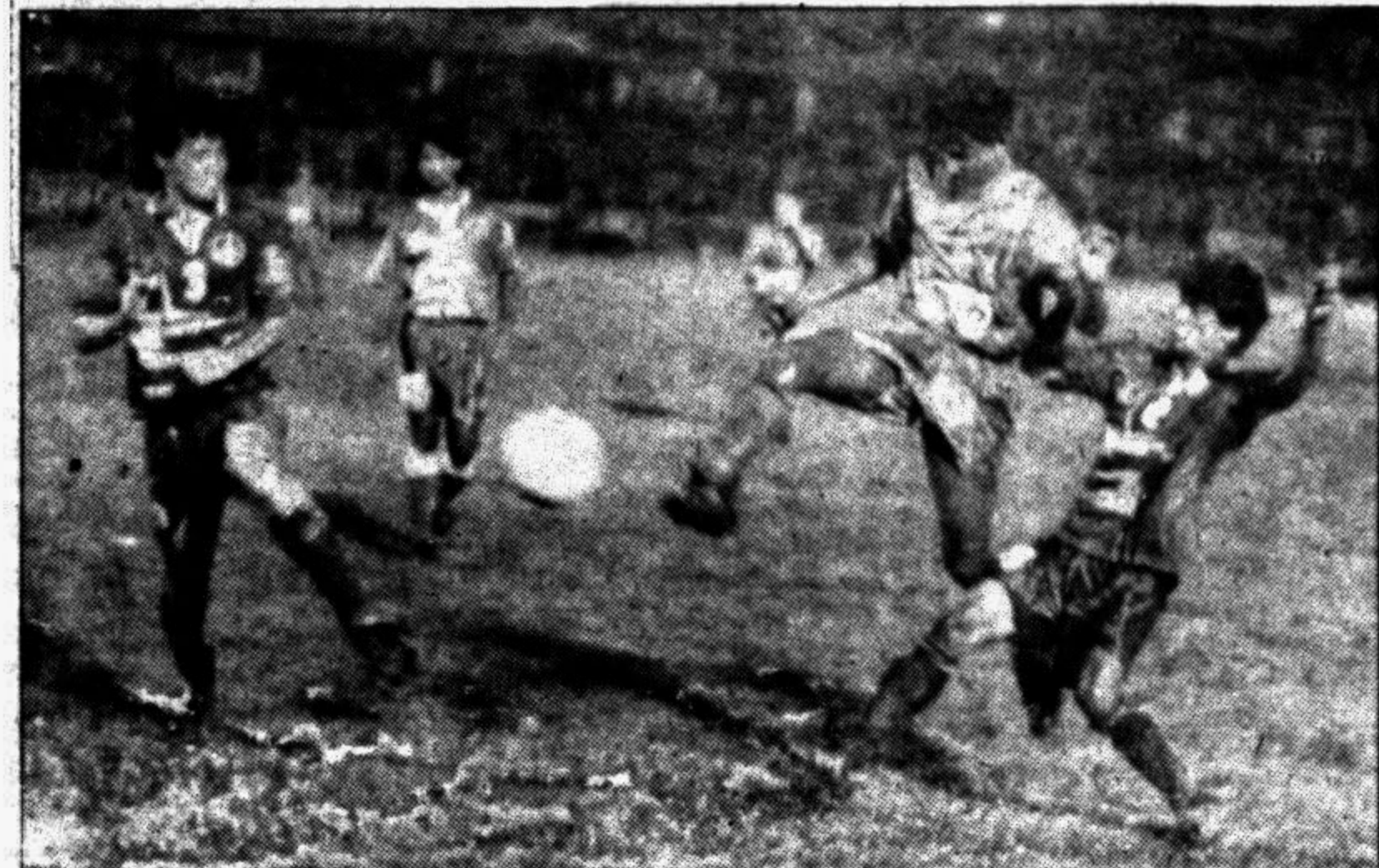
Action from yesterday's first semifinal of the Beximco 13th Federation Cup football tournament between Abahani Kriya Chakra and Muktiyoddha Sangsad at the Dhaka Stadium yesterday. Abahani moved into the final with a 2-1 win.