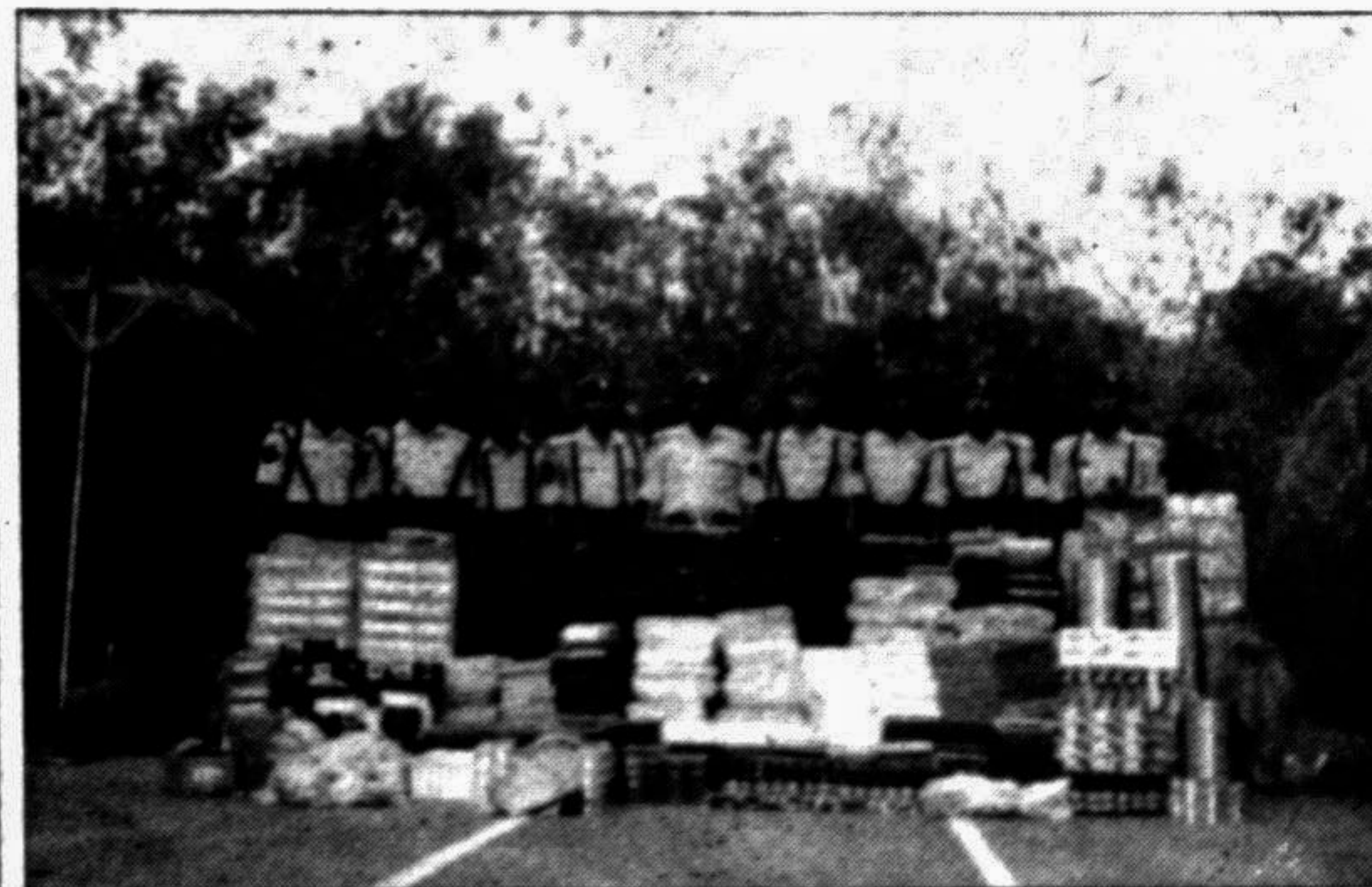
Smuggled Indian goods seized by BDR from Jessore border recently.

Another report adds: A man who was seriously injured by his opponents on June 4 succumbed at the district sadar hospital on Sunday.