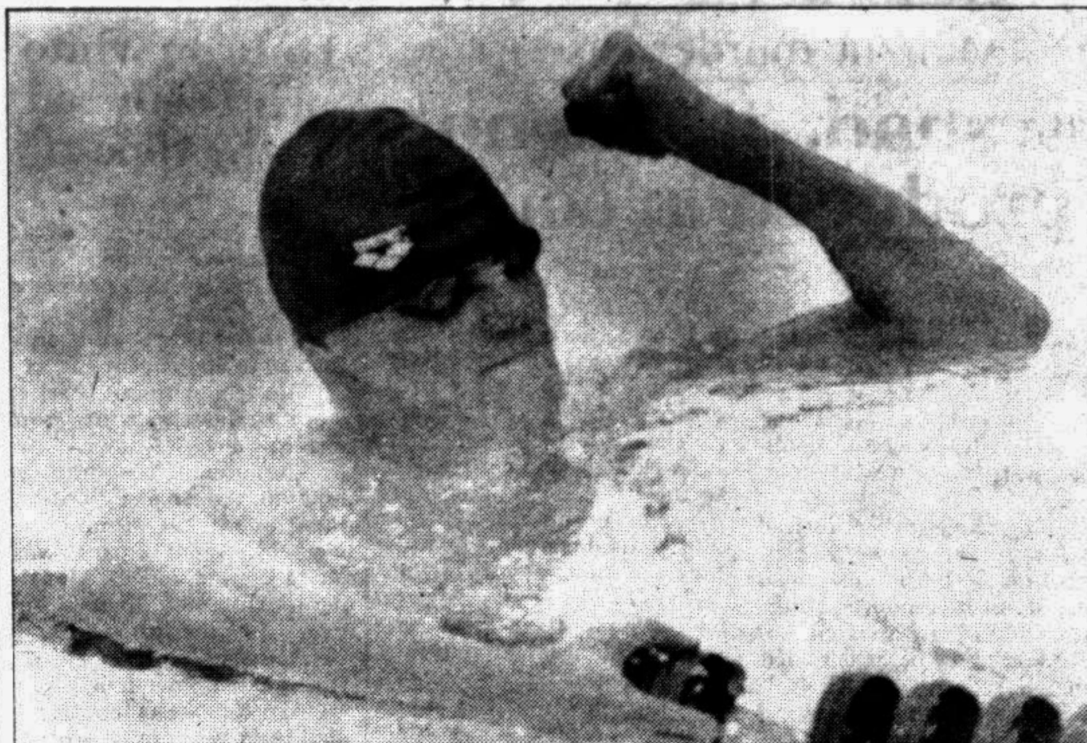
Russian Denis Pankratov, 21, punches the air after setting a new world record for the 200-metre butterfly at an international meet in France on June 14. Pankratov clocked 1.55.22.

Dunga, who scored seven goals in his 54 Bundesliga appearances for Stuttgart, will miss the club's home game against Duisburg on Saturday.