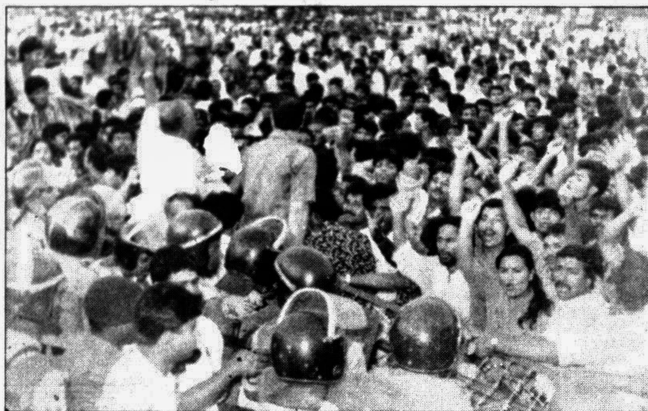
The Jatiya Party brought out a procession in the city yesterday denouncing the proposed national budget. — Star photo

Desperate, shameful, false or, even disgusting.